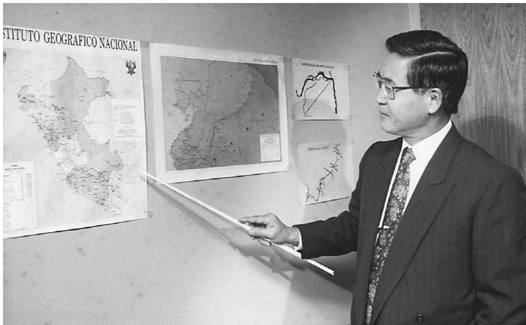
Peruvian President Alberto Fujimori. LaRouche told Gente, with respect to the assault against Fujimori, "there are people in Washington, including Mrs. Albright, who would try to push this as far as they can. Assassinations cannot be ruled out."

I don't know what you've got in terms of the news there in Peru today, but the Bank for International Settlements [BIS] has published a study, which contains a forecast, which is an accurate one. It essentially says that the United States is going to go under in a major financial crash. There will not be a soft landing for the United States. And, while there should be no illusions about the Bush crowd—the Bush crowd is as dangerous as the crowd around Al Gore, the Vice-President of the United States—nonetheless, presently, Al Gore is absolutely hysterical, because it's apparent to people in the government that he is not electable. And the President of the United States has made a great commitment to the Gore candidacy, which I think is foolish. And although I'm somewhat friendly to the Clinton Administration, I'm even getting a certain amount of hysteria against me because of this. And they're very unhappy with my policy on Peru, among other things.