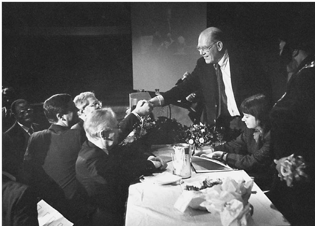
Lyndon H. LaRouche, Jr. in Washington, D.C.

there is no possible way of predicting exactly what's going to happen. We're going to have two significant third-party candidates, Pat Buchanan and Nader, running, which will make things complicated, especially under the present conditions.