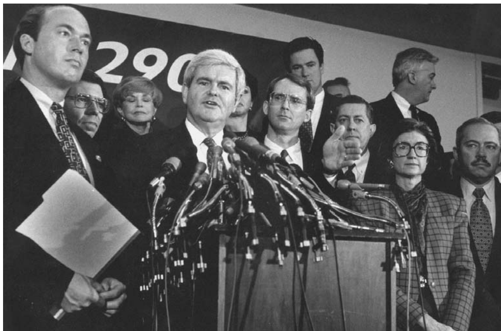
Former House Speaker Newt Gingrich and some among his Conservative Revolutionaries. The Republican "Southern Strategy" was an appeal to the "fundamentalist" bigots who brought Nixon and Kissinger into the White House, and began the process of wrecking the economy and morals of the U.S.A.

lateral Commission lackey and Zbigniew Brzezinski confederate Samuel P. Huntington, a perspective set forth by Huntington under the Carter-era rubric of a so-called "crisis of democracy." Thus, Project Democracy, better named "Project Lying Demagogy," was installed as the authority over both leading political parties, in 1982.