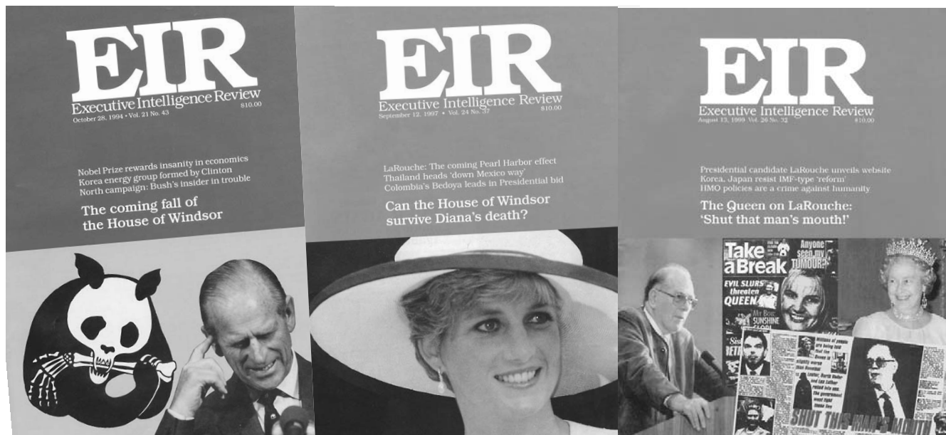
EIR's covers chronicle our ongoing battle with the House of Windsor.

Alegre, have, to the present day, the characteristics of a high-level intelligence operation of a type traceable to the nature of Anglo-French and American activities around the “witting” Paris Review of the 1950s. In this light, the French connections of Goldsmith’s operations targetting Brazil today, coincide with the intention of some to bring down the present government of Brazil. 6