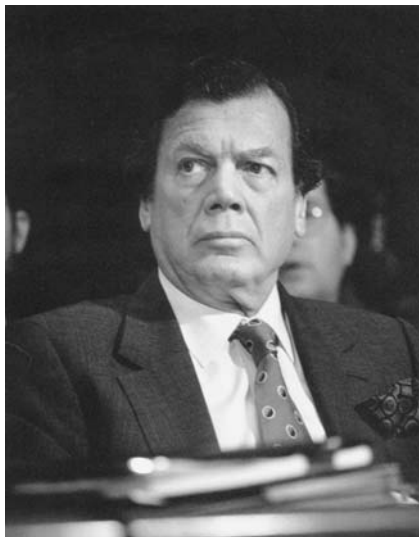
Canada's Edgar Bronfman, the one-time booster of East Germany's Honecker regime, is a point-man for British Commonwealth influence internationally.

cle, authored by notable journalist Wolffsohn, detailed the ongoing role of Bronfman as mediator between East Berlin and Washington, a role dating at least to 1985.