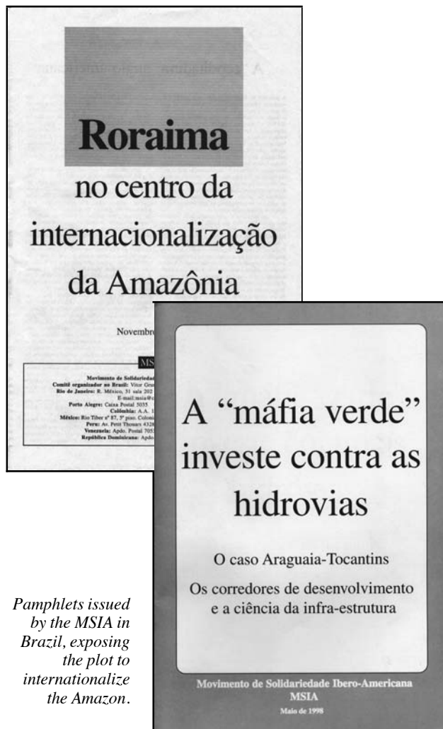
Pamphlets issued by the MSIA in Brazil, exposing the plot to internationalize the Amazon.

effect. That imprudence might, and, speaking morally, probably should become the instrument of WWF-Brazil's undoing.