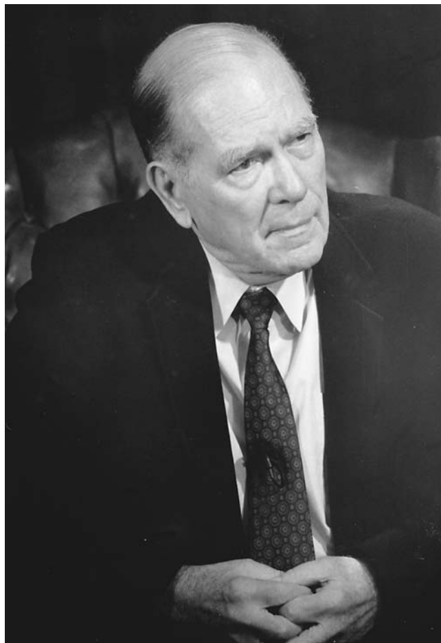
Lyndon H. LaRouche, Jr., candidate for the Democratic Party's 2004 Presidential nomination. "If the Democratic Party's forces do not rally around a figure, who not only clearly expresses the alternative to the folly of the Gore faction, but who expresses efficiently the applicability of the Roosevelt legacy to the specific character of the present economic crisis, the Democratic Party will flop."

The idea that every person is, even today, in some way qualified to lead under crisis-conditions, is mythological non-