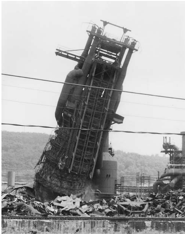
Demolition of a U.S. Steel plant in McKeesport, Pennsylvania, 1985. It is this "rust belt" phenomenon, which typifies the developments which have made the U.S. economy so vulnerable to the crisis of the region including California, today.

with the 1972 "détente" agreements with the Soviet Union, and "the opening to China," the need for self-reliant national economic security, was less keenly felt in leading policy-shaping circles.