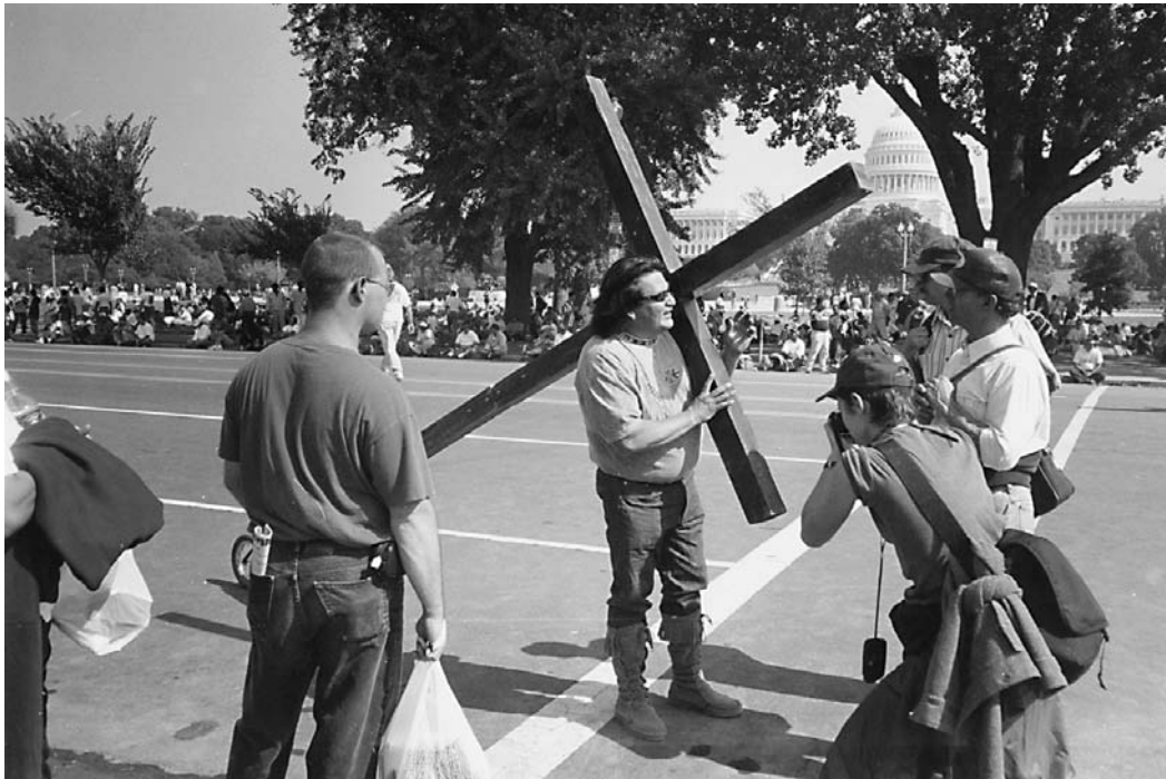
A rally by the Promise Keepers cult in Washington, 1997. The notion of the "Yahoo Factor," is demonstrated most dramatically, by the barking Elmer Gantry types among so-called religious "fundamentalists."

tive" so used, then as now, signifies the pro-feudalist-led opposition to the influence of the American Revolution of 1776-1789. That symbiosis is the danger to be averted; that is the most stubborn of the political obstacles to be overwhelmed, in the effort to bring about a rational solution to what is presently presented to us as the California energy crisis.