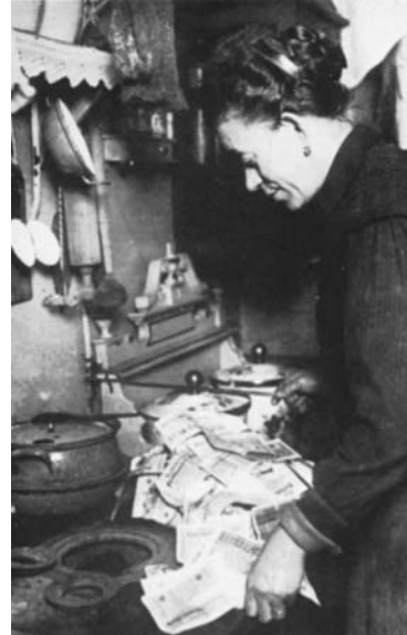
Hyperinflation in Weimar Germany during the early 1920s: left, a banker counts the uncountable; right, a housewife lights her stove with worthless currency.

susceptible to Romanticist influences, I understand it better than the post-Vienna Congress Clausewitz did. If you have a good cause, and can soundly outwit your adversary within the framework of the situation given to you, he is yours. You will defeat him, because your actions will occur in dimensions of physical geometry which he refuses to conceive as actually existing.