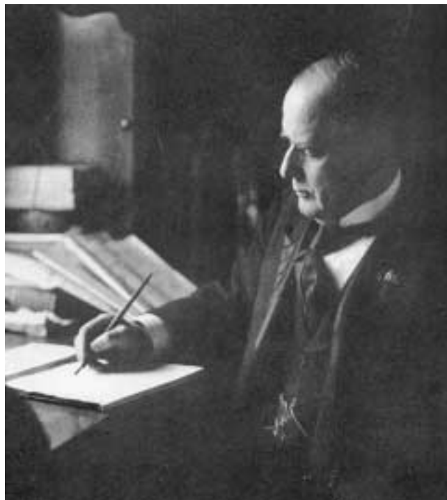
The most significant blow against civilization in general, was the assassination of President William McKinley (shown here) in 1901, which put Theodore Roosevelt into the Presidential mansion.

So, the great poet and tragedian, Friedrich Schiller, looking at the horror of the Jacobin Terror in France, said of France, “a great moment has found a little people.” The narrowness and the short-sightedness of a popular opinion obsessed with what it perceives to be its most immediate and short-term interests, is that form of moral mediocrity which is the most frequent cause of the horrors which a nation may