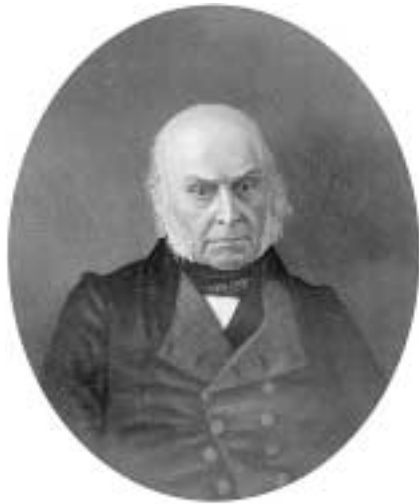
The American intellectual tradition: John Quincy Adams, as Secretary of State, defined the conception of a community of principle among a multi-polar array of sovereign nation-state republics.

the Careys, Monroe, and John Quincy Adams, saved the U.S.A. from dismemberment; but, the expansion of slavery and the spread of the related forms of corruption typified by Martin Van Buren's and August Belmont's Democratic Party of Jackson, Polk, Pierce, Buchanan, and McClellan, were the principal political correlates of the continued, combined moral and strategic weakness of the nation. This weakness prevailed up to the time of what has been justly called "The Second American Revolution," President Lincoln's great victory over the British monarchy's puppet, the Confederacy.