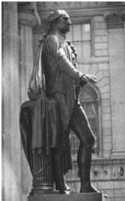
General George Washington was targeted by Samuel P. Huntington in his book The Soldier and the State , in an effort to rally contemporary utopians for a form of government, by beasts, reigning over hunted or herded human cattle.

moral authority to lead other nations, unless it is as zealously devoted to the general welfare of the community of nations, as to its own. This quality of government, the general-welfare principle, which was adopted as the fundamental constitutional law of the U.S.A., in the Preamble of the Federal Constitution, defines the only moral form of government. This is a form of government which has repudiated such abominations as the Roman Empire; whereas, contemporary U.S. utopians, such as Zbigniew Brzezinski and Samuel P. Huntington, base their perverted model of soldier and state, on their intention to establish a form of government, by beasts, reigning over hunted or herded human cattle.