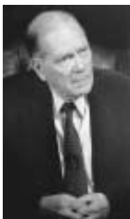
EIR Contributing Editor, Lyndon H. LaRouche, Jr.

gives subscribers online the same economic analysis that has made EIR one of the most valued publications for policymakers, and established LaRouche as the most authoritative economic forecaster in the world.