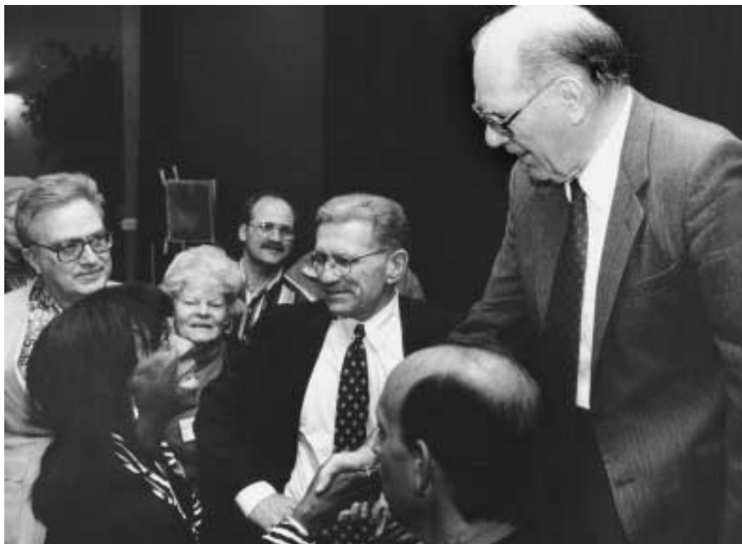
LaRouche: "There was never a case of an imperilled civilization which did not depend for its survival upon so-called 'lone voices.' "

were key elements of this pact. Reality impelled the leaders of the U.S. Senate to violate part of that insane agreement, as a unilateral U.S. action.