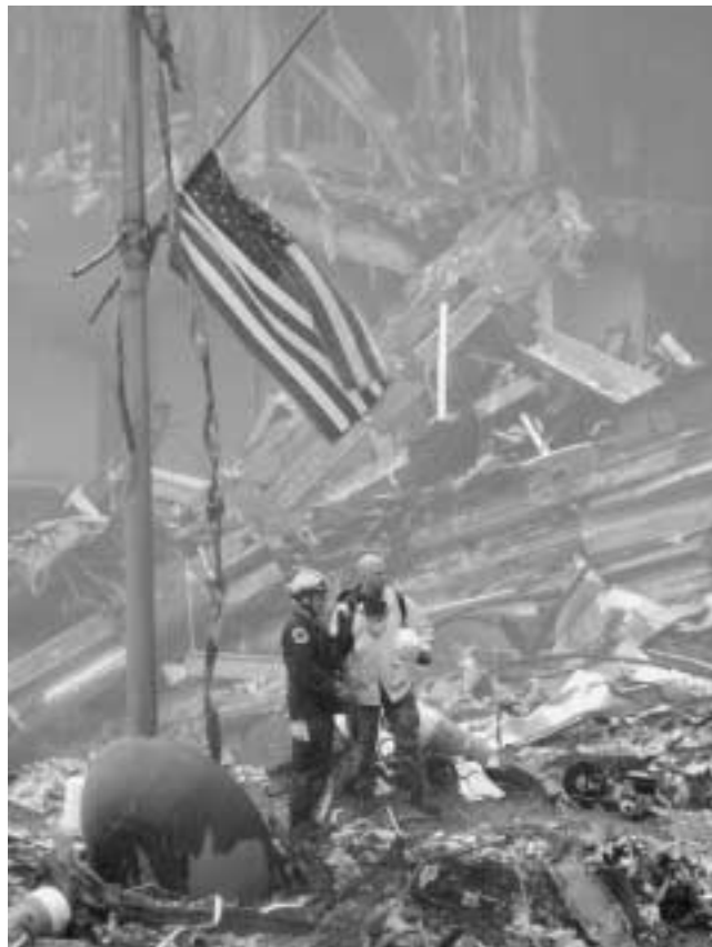
The World Trade Center on Sept. 11, 2001. Since that date, and especially since President Bush's State of the Union Address on Jan. 30, 2002, "the doctrine of global perpetual warfare has been, and is today, the only strategic policy of both the current government and leadership of the two major political parties of the U.S.A. and the current British government."

By her actions, Carla del Ponte is currently, whether fully witting, or not, a bureaucratic instrument of that policy. She