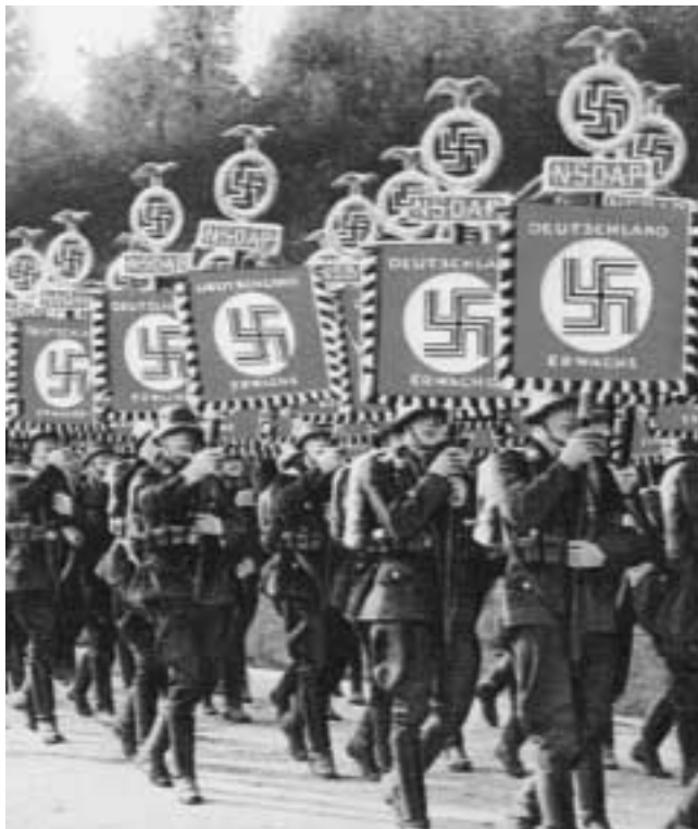
The Nazi Waffen-SS on the march. Today, the “utopian” advocates of a one-world empire, called “globalization,” have copied the methods of perpetual warfare from both the ancient Roman legions and the Waffen-SS.

President of the U.S.A., is what he is, and no more than that. His role must be taken into account, but excessive focus on his personality distracts attention from the powerful enemy “behind the throne” who is the real power behind the policies which the President is permitted to utter.