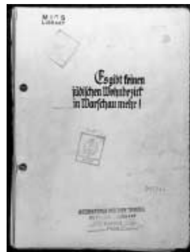
Left: Nazi SS troops guard Jews—including two women—captured in the suppression of the Warsaw Ghetto uprising of 1943. The original German caption reads: “These bandits offered armed resistance.” Right: The report of SS Maj. Gen. Jürgen Stroop, titled “The Jewish Quarter in Warsaw Is No More.”

war, or in a battle. And they have to be respected as that. They may be wrong, but if you capture them, or if they surrender, you treat them with the respect their position requires. No: Not true of this situation.