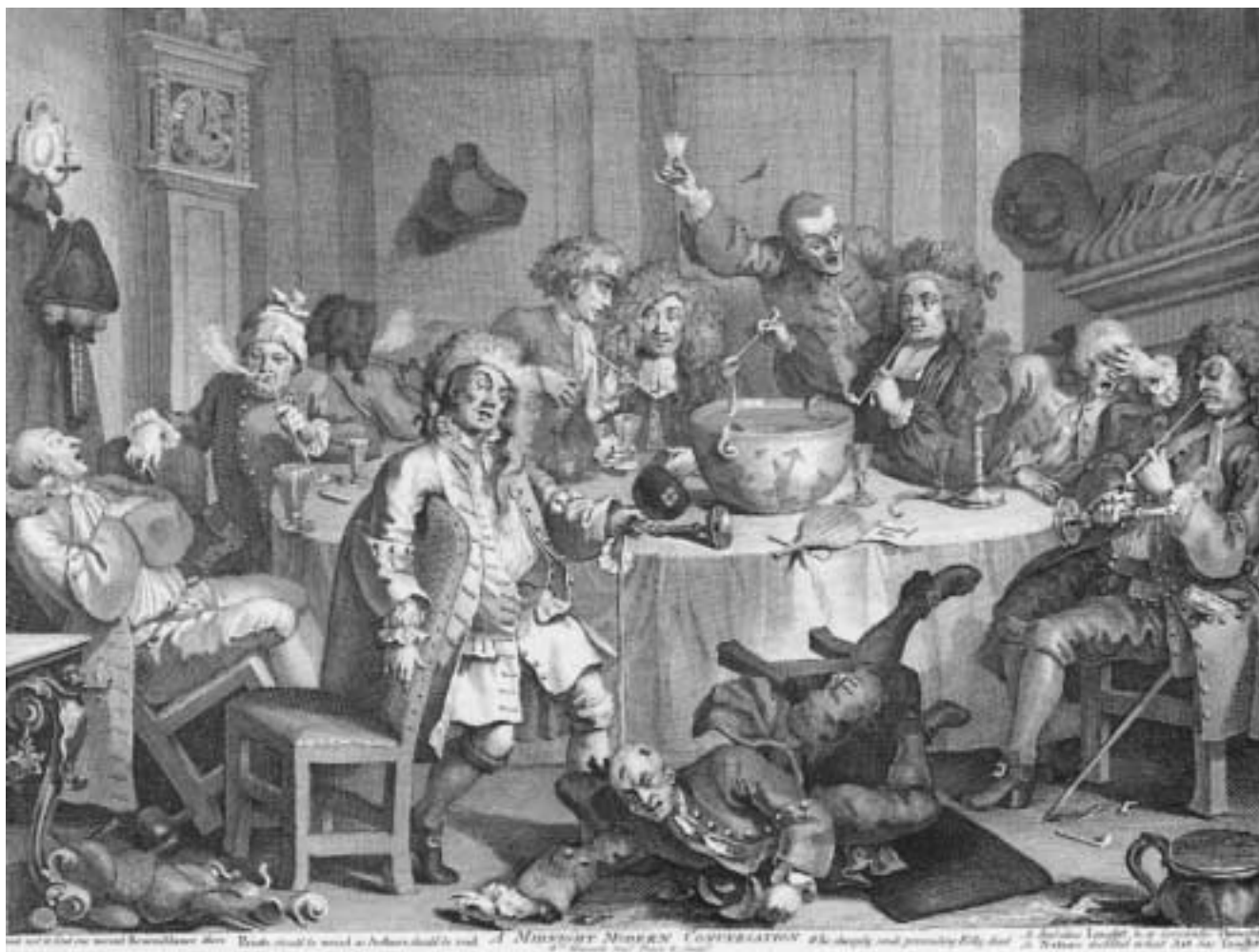
William Hogarth, "A Midnight Modern Conversation."

edly, was seized by a fit of remorse, or, perhaps, triumphalism, and established the temple of snake-worship called the cult of the Pythian Apollo at that gravesite.