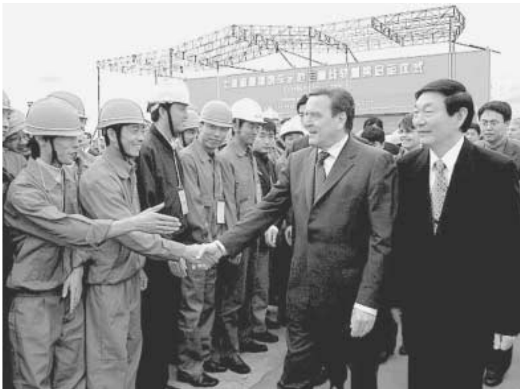
The courageous stand taken by German Chancellor Gerhard Schröder against an Iraq war helped to block the Utopians' "clash of civilizations" policy. Here, Schröder (left) visits the construction site of a Transrapid maglev train in Shanghai in February 2001. With him is Chinese Prime Minister Zhu Rongji.

pire. This was the reason for geopolitics as it was launched towards the end of the 19th Century and during the course of the 20th Century.