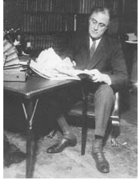
The U.S. Presidency is a wonderful institution, unique among the world's governments. Left to right: Benjamin Franklin (never President, but a genius who shaped the institution of the Presidency), Abraham Lincoln, and Franklin D. Roosevelt.

done—on several occasions, I've done several very important things of strategic significance, as a private citizen, in conjunction with circles in the permanent government. So, a lot of us are in this orbit, of being part of the Presidency, or being assets of the Presidency, and we generally work together, or fight each other. But when we are united, we can generally get a President of the United States to come to a fairly reasonable decision.