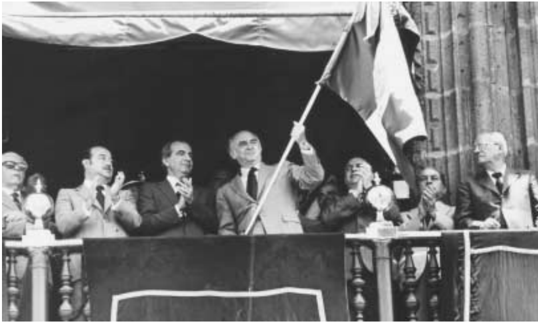
Mexican President José López Portillo on Sept. 3, 1982, after his nationalization of the banks. LaRouche's "Operation Juárez" plan for Ibero-American economic integration was on the agenda, until continental support for López Portillo's initiatives was blocked by Henry Kissinger.

denominate it, without making it negotiable, and use it in a central facility as a credit-basis for creating expanded investments in the hemisphere.