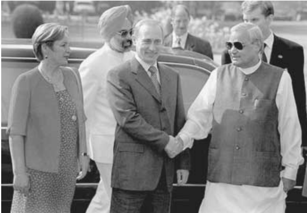
The presently emerging “Strategic Triangle” was first proposed by LaRouche in August 1998. Here, Russian President Vladimir Putin (center) meets with Indian Prime Minister Atal Bihari Vajpayee in New Delhi, during a December 2002 tour that also took him to Beijing.

together with certain reforms that must be made in terms of regional and international monetary-systems arrangements. But under those conditions, if Europe enters into what I’ve called a New Bretton Woods style of agreement, replacing the present monetary system, in that case, then the area of Russia, China, India, and their adjoining nations, will become the greatest market on this planet, for the long term, for a period of a quarter-century to a half-century. These areas of the world, which have some high technology—as China does, obviously, India does, and so forth—can not meet their internal needs, by their own high-technology capacity at this time. China, for example, must move from its characteristics of the past, as a coastal economy, a coastal-region economy, to develop the interior of China. This means large-scale infrastructure, it means water systems, it means new cities, it means all kinds of development. It’s a large area. China can not exist without developing this so-called “internal market,” for its continued economic life.