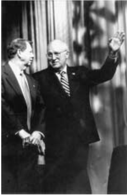
"The neo-conservative cabal around the present U.S. Administration's Vice-President Cheney, is typical of the liveried lackeys deployed by a Synarchist private banker's cult," to use America's power, and wars and threats of wars, to enforce an imperium.

ogy for slavery, was excused on the presumption that persons of dark-skinned African descent were naturally predestined to be property, on grounds they were not truly human. The use of such a theological argument, presented as within the bounds of Christianity, represents a pro-Satanic quality of evil, precisely because it is a crime against the institution of Christianity itself.