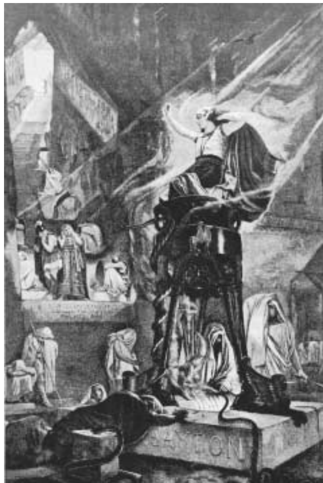
The Delphic Oracle of Apollo; the priestess Pythia issues "religious" orders. "Such is the religious belief of the empiricist or his dupe today. Such is the basis for the relative successes of the Martinist cult and of the bankers who deploy it for purposes of managing those herds of stock-market dupes and other human cattle which they cull."

Earlier, Mandeville, the resident Satanic object of adulation by the Friedrich von Hayek's post-World War II Mont Pelerin Society, had been explicit in his claims to be, and to promote, evil. Witness the Mont Pelerin Society's adoption of Mandeville's paean to Satan, The Fable of the Bees . Quesnay's doctrine of laissez-faire , from which Adam Smith copied his "free trade," had been premised on the argument on which the economic doctrine of the French Physiocrats as a whole, and recent decades' turns in U.S. agricultural policy have been premised: that the farmers employed on the lazy, titled landlord's estate were merely human cattle, who had no part in creating the profit of the estate, or society as a whole; rather, the landlord, by virtue of the Satanic magic of his position as title-holder (e.g., "shareholder"), was the only