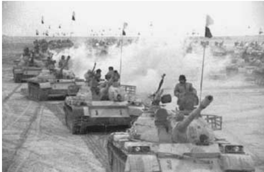
One thing John Ashcroft would now prefer you not know: Ashcroft's own history of energetic support and defense of at least one large, armed, terrorist formation on the State Department's list, the Mujahideen e-Khalq (shown here in Iraq, where they were Saddam Hussein's allies against Iran). The Synarchist tendency Ashcroft belongs to, while hankering after police states, freely use "religious" terrorism to bring them about.

issue of the current time. This was, originally, the banker-backed terrorist cult used to direct that great internal, systemic threat of 1789-1815 to France, and to the world of that time. This same banker-cult symbiosis was behind Mussolini's dictatorship, behind Francisco Franco's dictatorship, and behind Adolf Hitler's role during 1923-45. This was the threat posed by prominent pro-Synarchists inside the British Establishment, who, during the World War II setting of Dunkirk, had attempted to bring Britain and France into that planned alliance with Hitler, Mussolini, Franco, and Japan—which would, if achieved, have aimed to destroy the U.S.A. itself by aid of that consort of global naval power. That was the enemy which we joined with Winston Churchill to defeat, in World War II.