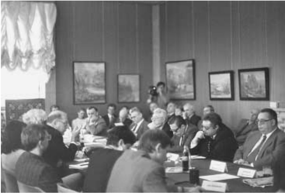
Seminar on “Russia, the United States, and the Global Financial Crisis,” in Moscow on April 24, 1996. American statesman Lyndon LaRouche is speaking (at left, in front of the table); seated are Russian Academy of Sciences member Leonid Abalkin (third from right) and former U.S.S.R. Prime Minister Valentin Pavlov (right).

nation. In that system, the physical functions of a notion of entrepreneurship premised on sovereign individual powers of creativity—not so-called “shareholder values”—constitute the accepted notion of the legal right to exist of business enterprises. The recent decades of systemic destruction of the true entrepreneur, as in the U.S.A. and Germany, in favor of the financier’s large corporations, typifies the means by which the spread of something worse than economic mediocrity has infested the Americas and Europe. The hypocrites of these times speak much of “human freedom,” but do all in their financial-corporate power to crush actual creativity out of its rightful essential place in the economy at large.