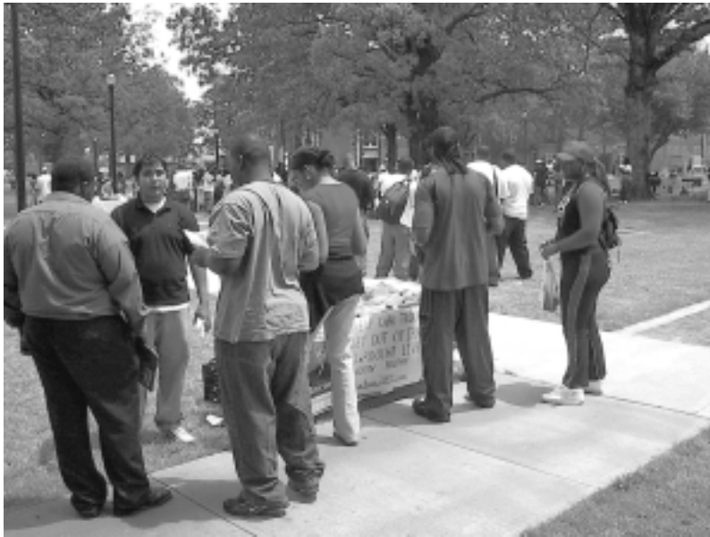
LaRouche Youth gathering support for the candidate at Arkansas campuses in late April before his campaign appearances in the state. LaRouche polled 7% of the Arkansas primary vote on May 18, despite a large vote for an “uncommitted” line put on the ballot to siphon off votes.

Until after November. Until after the election. It will not come until after the election! We have decided!”