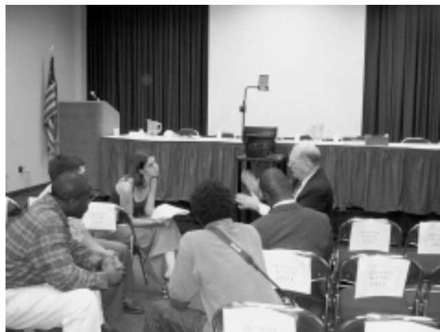
Lyndon LaRouche meets with several organizers of his LaRouche Youth Movement in Montgomery during his campaign swing in Alabama. The candidate's youth movement is the only mobilized youth leadership force of its kind supporting a Democratic candidate.

But the policy was already there! You didn't need the pictures, to know the policy. You didn't need the pictures, to know that's what was happening in Guantanamo Bay. You didn't need the pictures, to know all these arrests and suspensions and roundups, like roundups after the Reichstag Fire in Germany. Göring set fire to the Reichstag, and they began rounding everybody up they didn't like. Here, in the United States, they began rounding up Muslims—just rounding them