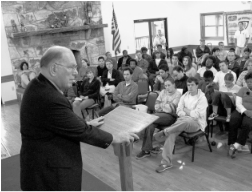
Part of the gathering of LaRouche Youth Movement activists and recruits at the Pennsylvania weekend “cadre school” listens to the candidate on May 8.

reason why they did it?” There was no rational reason. There was an obsession, just like Ashcroft’s religious obsession. Like religious fanatics’ obsession. Do you think the Battle of Armageddon is going to mean that God is going to intervene, and these guys aren’t going to have to pay the rent next month? They believe it! They say they believe it. They get up there, and they give these long-winded speeches at these revival meetings, and they promise things exactly like that. Do you believe that any of the things these preachers say is going to happen? Do these people appear to believe that? They appear to believe it. Fanatically. They appear to believe it, with or without DeLay! That’s the kind of society we live in.