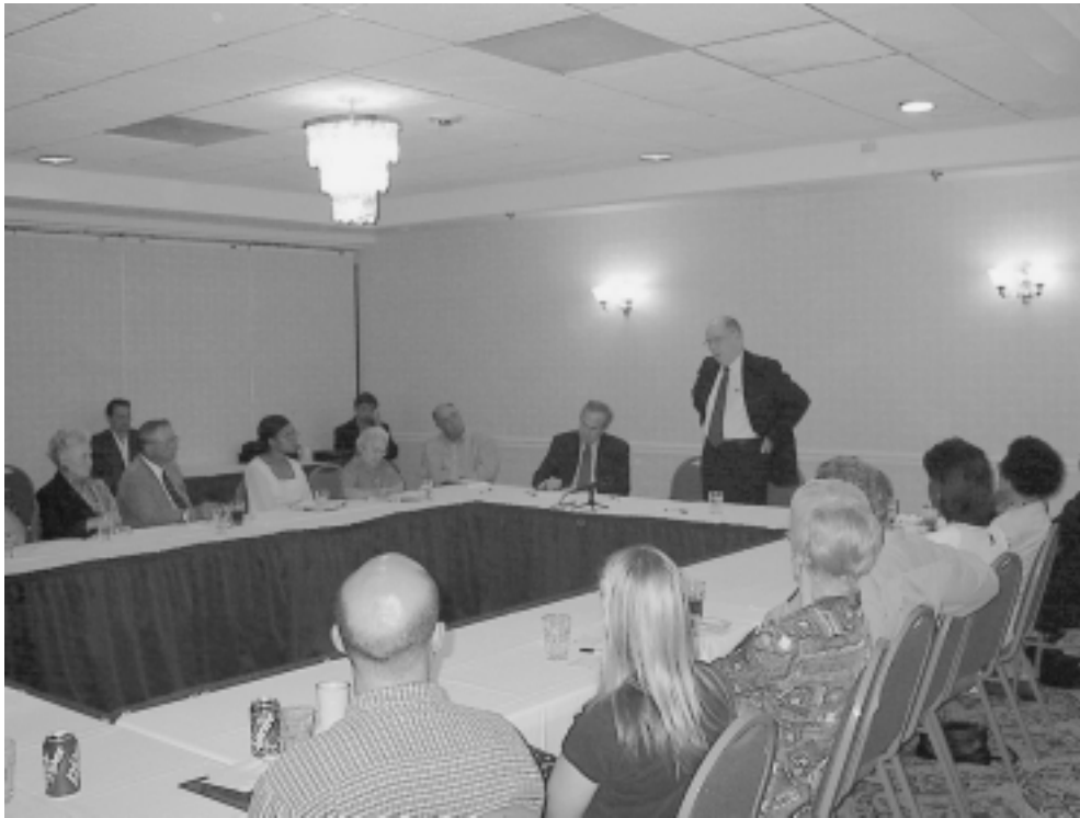
The Arkansas legislators group in discussion with LaRouche. While he was in the state, the Arkansas Democrat-Gazette ran the refreshing headline: "LaRouche Says Bush 'Dumbest' President."

tion and distribution. That is a quarter-century to a half-century investment. What you spend, today, will be a physical asset which secures that payment, for a quarter-century to a half-century to come.