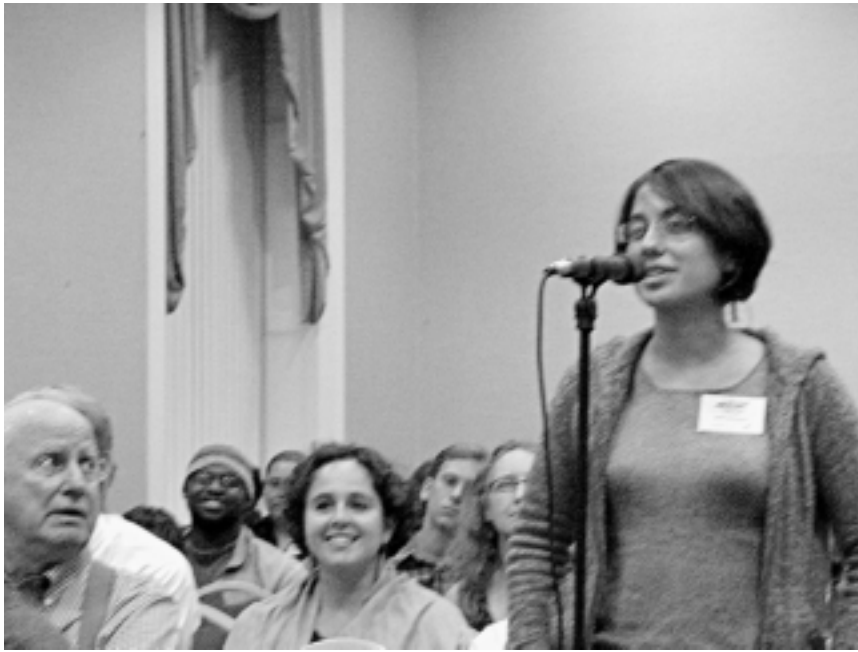
Questions to the candidate came from many of the more than 100 LaRouche Youth Movement organizers in Boston for the Convention, and others they had brought to the event.

and they are wrong.” We can not let this country go to Hell, out of spite and anger, against their foolishness. This is our country! It belongs to us, historically—not to them! And, we have to defend it. We have to defend it through the institutions of government, which were created, in a republic and a Constitution which is the oldest in the world. No Constitution of any other nation has lasted as long as the Constitution of the United States! This is the finest system of government which has ever existed on this planet, despite some of the rogues and thieves that have taken over and run it. This is the nation, under whose Constitution the world was saved from a depression; the world was saved from the threatened empire of world Nazism.