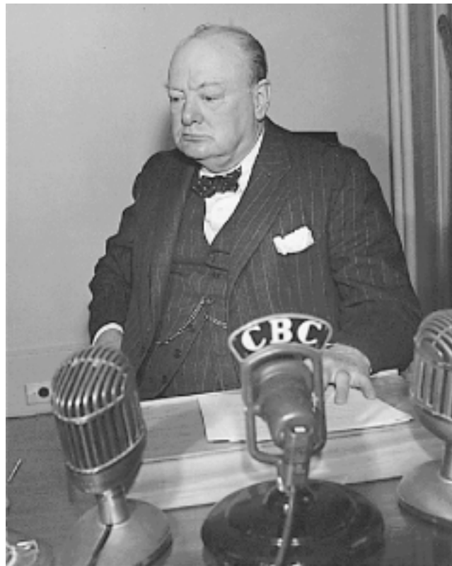
Sir Winston Churchill, in order to preserve the British Empire, engineered a right-wing turn in the NATO countries immediately after Franklin Roosevelt's death, using former Nazi Party elements to do it.

So therefore, since Europe has not recognized that institutional, self-destructive characteristic, of the so-called Liberal system of parliamentary democracy, Europe has proven itself, repeatedly, impotent, to deal with that problem. Whereas, the United States, despite making the same kind of mistakes, is constitutionally of a different form: that, under the U.S. Constitution, which is anti-Liberal, under the U.S. Constitution, we have come back repeatedly, as most notably, under Abraham Lincoln and under Franklin Roosevelt. Europe has not developed, despite the noble efforts of Charles de Gaulle in France, during the Fifth Republic period, up until 1963—Europe has not succeeded in producing a durable form of