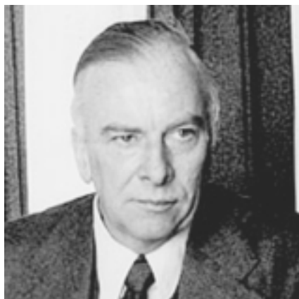
The economic hit men and their “jackals” were behind the assassination of world leaders who stepped out of line, including (left to right) Panamanian chief of state Gen. Omar Torrijos Herrera, Indian Prime Minister Indira Gandhi, Indian Prime Minister Rajiv Gandhi, and German bankers Alfred Herrhausen and Jürgen Ponto.

Shultz, as such, went on in the Azores Conference in 1972, to lead in destroying the post-war Bretton Woods financial-monetary system—which is what we’re fighting about today.