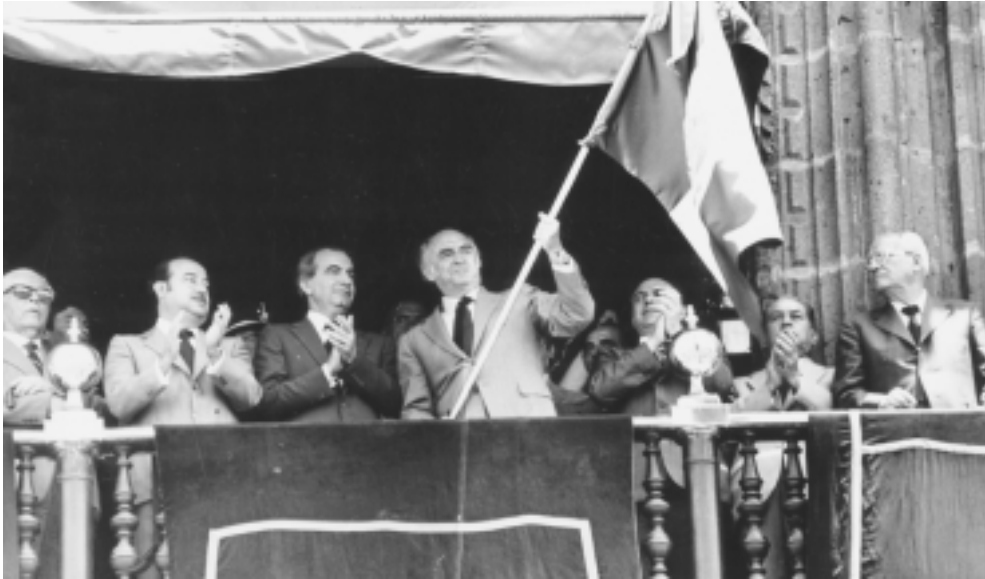
Mexican President José López Portillo was targetted for ouster by Wall Street in 1982, when he took up LaRouche's "Operation Juárez" plan for a debt moratorium and a new global financial system.

the United States, reached the position of challenging and taking over, temporarily, the direction of the world monetary-financial system, in a way consistent with the American System. Now, this was not something that was not desired by many people in Europe, but it was the United States representing that policy, which enabled things in Europe to occur, as in the reconstruction of war-torn Europe, during the period from 1945 through about 1964-65. So, the reconstruction of Europe, is a gift of the Americans.