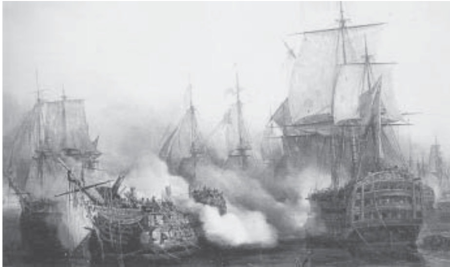
The Battle of Trafalgar, Oct. 21, 1805. Once Britain's Admiral Nelson had won the crucial battle there, Napoleon was bottled up within continental Europe, where his role was to bleed France itself almost to death, while destroying the other nations of the continent.