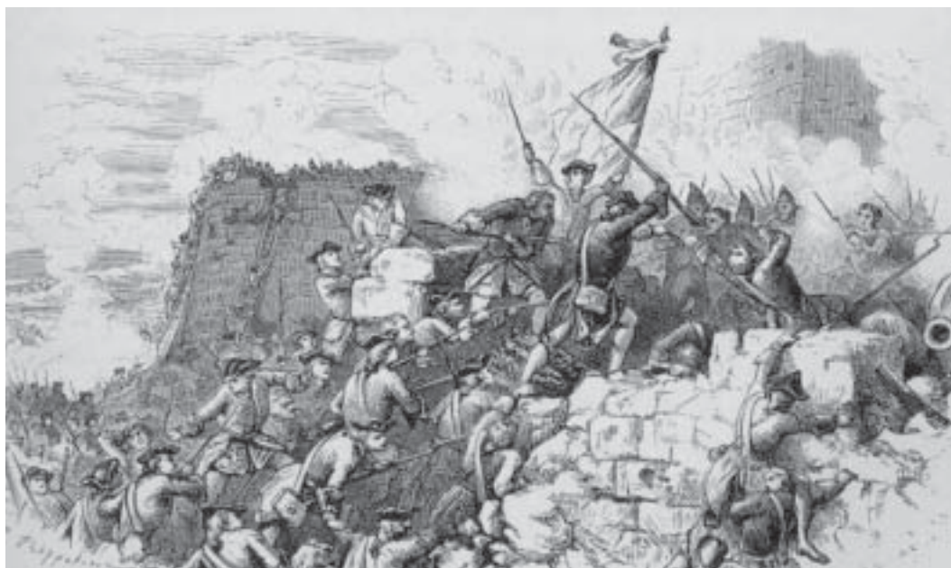
During the Seven Years' War (1756-1763), the Anglo-Dutch Liberals battled to control the nations of continental Europe, and to maintain colonial rule in North America. The war concluded with the Treaty of Paris in February 1763.

Since the Anglo-Dutch Liberals' imperial triumph in the Seven Years' War, new wars based on that model had been the continuing chief source of the repeated ruin of the continent of Europe, and of Eurasia. It was this British policy and its