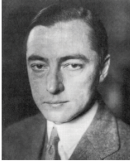
Richard Count Coudenhove-Kalergi was employed by the Synarchist International in the effort to install a fascist government in Germany. He later emerged as the leader of Pan-Europa.

The relevant Twentieth-Century, British view of the U.S.A. as an adversary, had been exhibited already in the naval parity disputes of the immediate post-World War I period, when the British plan for the Japan naval attack on Pearl Harbor was hatched as part of the plan for a naval alliance of Britain and Japan against the threat of U.S. naval power's development.