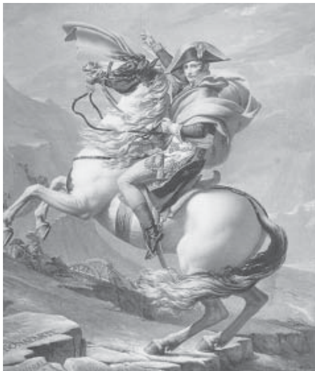
Although some people, still today, consider Napoleon Bonaparte as a hero of modern France, he was in fact a creation of the Martinists and Robespierre—and the predecessor of Adolf Hitler. Here, "Napoleon Crossing the Alps," by Jacques-Louis David.

The British assets associated with the anti-Leibniz circles of Shelburne's operations in France, included not only the