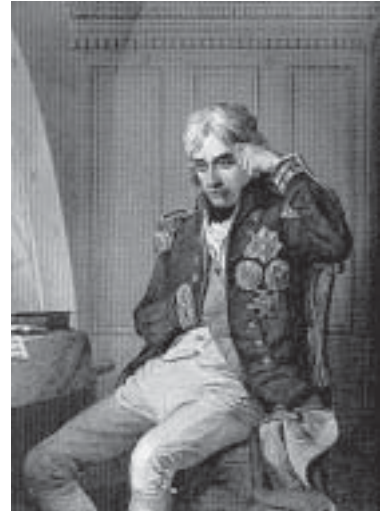
Adm. Horatio Nelson, who beat Napoleon at the Battle of Trafalgar, advancing Britain's geopolitical control of the continent.

the nations of the continent, as the earlier Seven Years' War had paved the way for the establishment of the British East India Company as an empire at the fateful February 1763 Treaty of Paris. Some people, still today, curiously, regard Napoleon as a hero of modern France. 14 I would prefer Jeanne d'Arc, Louis XI, Cardinal Mazarin, Jean Baptiste Colbert, Lazare Carnot, and Charles de Gaulle, and also, in a certain important sense, the lovely historical irony of the Richmond who followed Louis XI in more than one respect, as England's Henry VII.