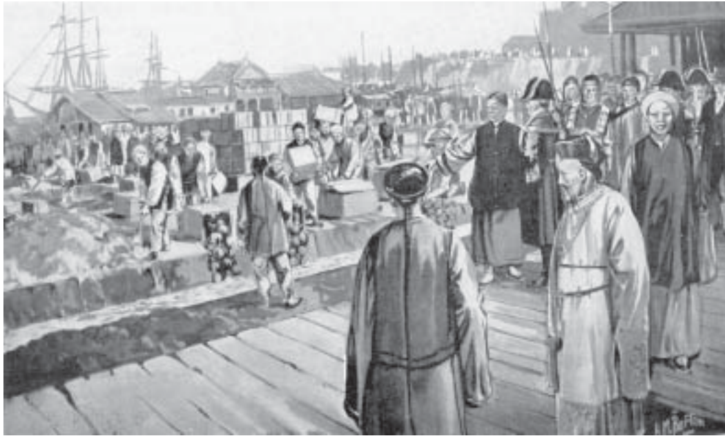
The British Empire was initially established as an empire of the British East India Company, which looted China by means of the opium trade. Here, Chinese authorities are shown fighting back by destroying an opium crop. Britain responded to such insubordination by waging the Opium War of 1839-1842.

practice, rooted in the model of the Seven Years' War, which had been the original source of the recurring mortal conflict between the future U.S.A. and the British Empire.