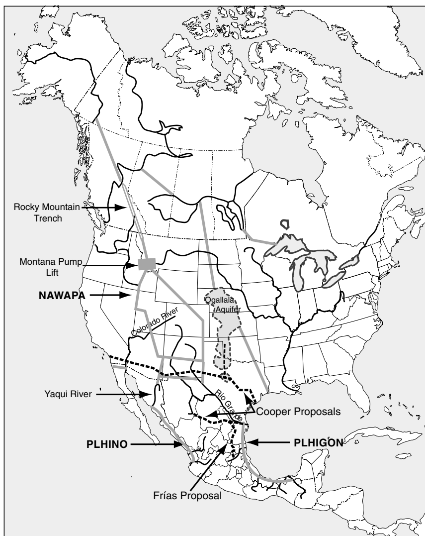
FIGURE 1 North America: Great Water Projects