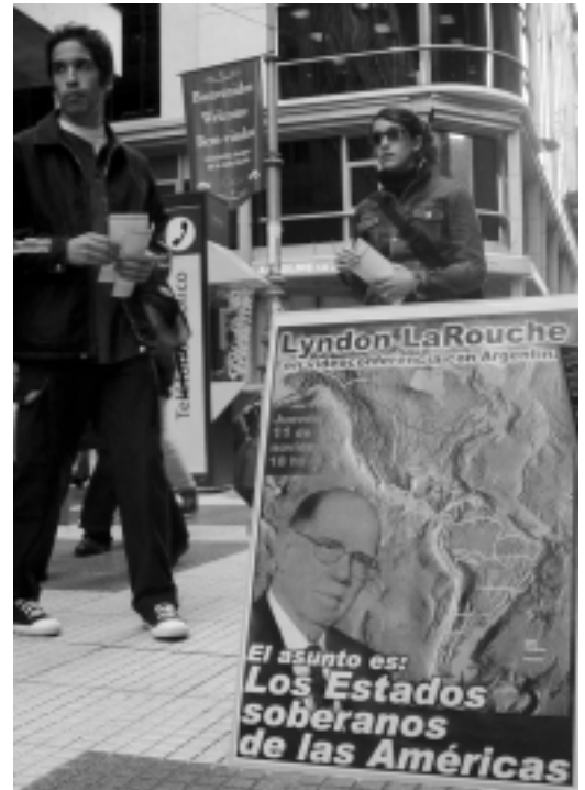
Left: The LaRouche Youth Movement at a rally in Mexico City, against the energy policy of the Fox government. The LYM is calling for a return to a nuclear energy policy, which has been abandoned in Mexico for 20 years. Right: LYM organizing in Buenos Aires, Argentina.