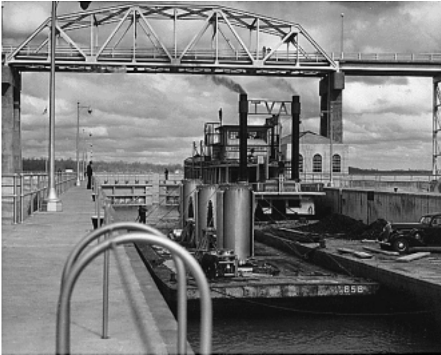
The Wheeler Dam navigation lock in Tennessee in 1942, constructed by Roosevelt's Tennessee Valley Authority. This was the first of eight dams that the TVA constructed on the Tennessee River. The Federal government provided the credit for these massive infrastructure projects, to get the economy moving again.