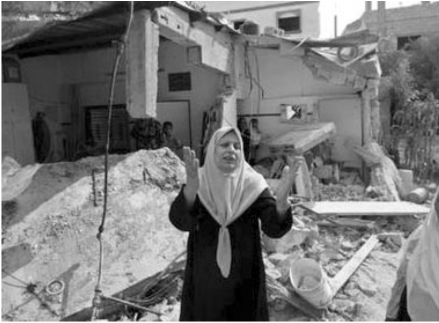
Embassy of Lebanon

LaRouche underlined that the entire population of Lebanon is behind Hezbollah in this war, viewing Israel as the aggressor. "Now, this is asymmetric warfare," he said. "Which means that regular armies, as we see in the case of Iraq, regular armies trying to fight their way, and win that war, as Bush keeps saying, can not do it!"