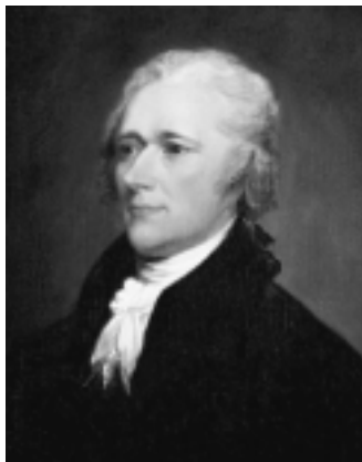
Alexander Hamilton, one of the framers of the American System of Political Economy, with the frontispiece of his 1791 "Report on Manufactures." "We have to go back to the principles of the American System," LaRouche said.