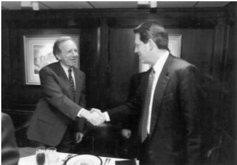
We have one Laurel-and-Hardy team, Bush and Cheney, and another one in the wings, McCain (the ranter) and Lieberman (the thug, on the left here, with Al Gore). Tell the truth about them, LaRouche said.

Podesta and so forth, because I said so. I wrote a profile and published it, which was intended for the edification of the Clinton Administration, that this guy [Lieberman] is a damned menace! And it was Al Gore who picked up this creature, this fascist running around as a Republican, a Buckley fascist, working with a Cuban gang—whom I knew from the time when I was down in Cuba where these gamblers, these gangsters, who were running the country under Batista, came to be called “freedom fighters” in the United States, in Florida. And this was where Lieberman went for support, and he got the support from a certifiable fascist, Buckley, the Buckley family. How does somebody call this a Democrat? You’ll be calling a six-legged monster a Democrat, the next thing you know.