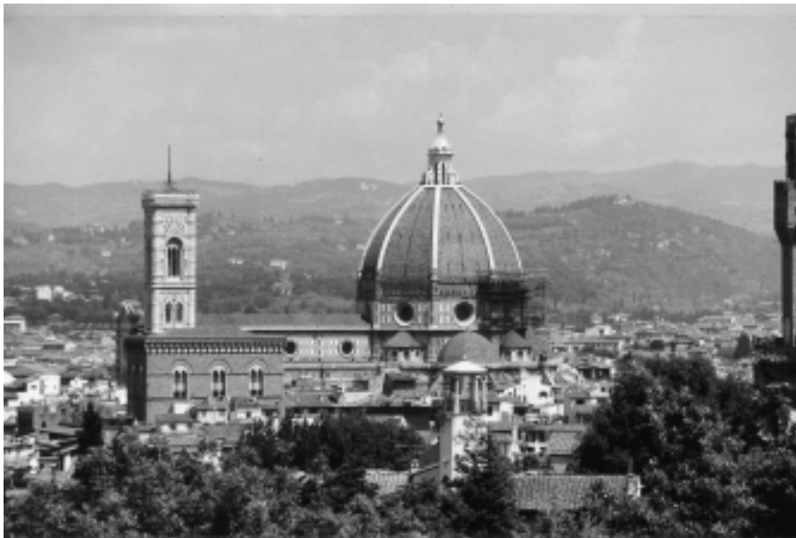
The Brunelleschi dome on the Cathedral of Florence. The science that characterized the Florence of the Renaissance and the aerospace program that came out of the circles of Enrico Betti and Bernhard Riemann, LaRouche said, were overturned in cultural warfare that destroyed the population. It is up to the youth now, he said, to mobilize a revolutionary force, based on a mastery of science and art.

looked at this, and I said, “This is it! This is it! This is the catenary! This is one of those things!” And [my guide, an expert on Brunelleschi] said, “Yes, yes, yes.” And all of this wonderful art work that comes out of there.