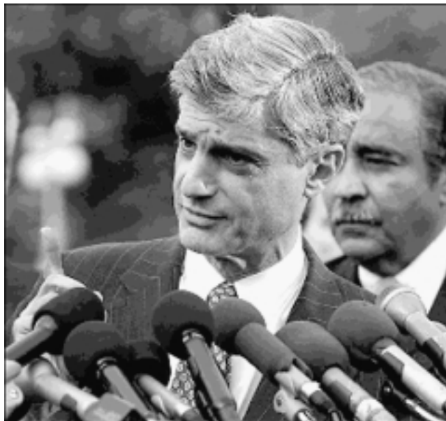
Former Secretary of the Treasury Robert Rubin: an intelligent and courageous man, but he’s not offering any solution to the economic crisis which he sees clearly.

But I agree with him on this point: that he is what he is, and I am what I am, and I have no objection to the fact that he’s greatly understating the problem, and not identifying the solution, even to the degree that he does have a solution. Because his job is to move things forward, to get people off their butts, so to speak, to recognize that there is not a happy economy out there, there is a terrible economy, in which the lower 80%, even the lower 90% of family-income brackets of the United States, in particular, are suffering greatly. In which every nation-state of continental Western and Central