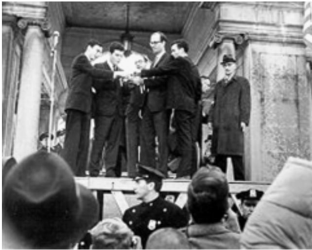
War Resisters League

Burning draft cards in 1965. The Boomers who were in the universities in the 1960s didn't explode as long as they had draft exemptions for being students. But when those exemptions were cut, they went wild!