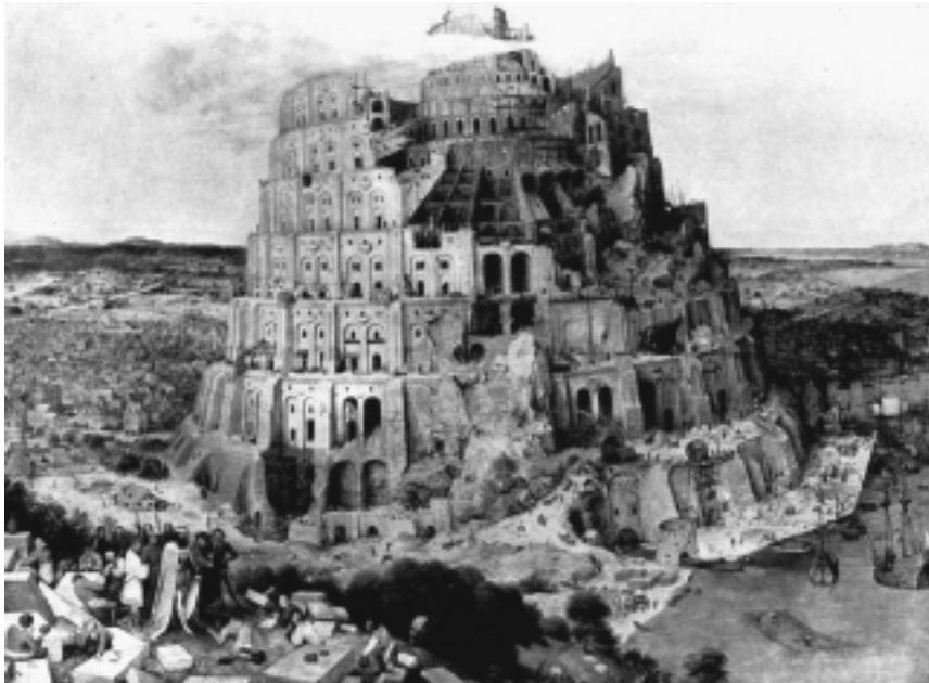
Human culture means, fundamentally, the progress of development of the specifically human cognitive powers of the human species, in opposition to globalization's "Tower of Babel" (e.g., "Babble"). Shown here, Peter Bruegel's painting "The Tower of Babel" (1563).

These considerations lead our attention to two, successive statements of principle respecting human nature. The first step, especially in the U.S.A. today, is to recognize the true genius of Frederick Douglass, as against all those foolish fellows, especially among the "macho-like" behavior of some descendants of slaves, who reject Douglass's wisdom on this account.