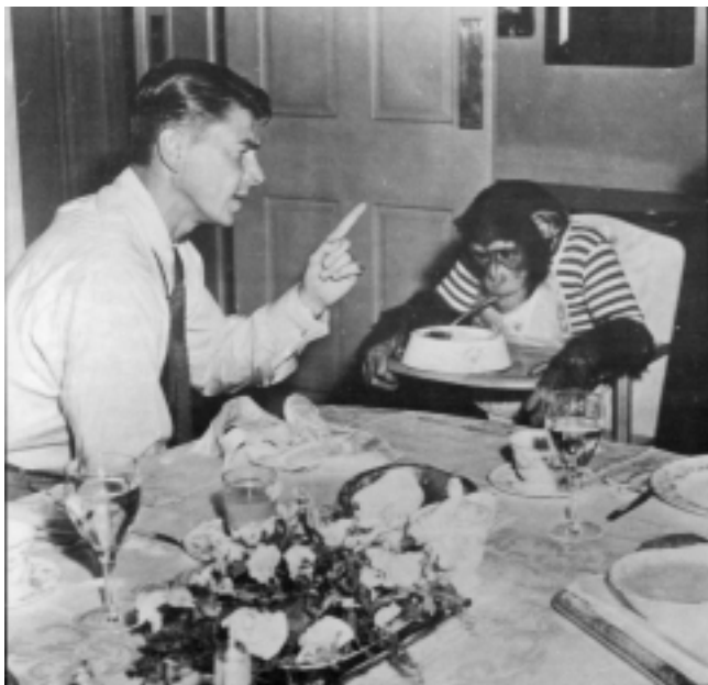
Screen-star (and later President) Ronald Reagan, is shown here with the chimp, from the movie "Bedtime for Bonzo." Today, it's bedtime for Al Gore, who should be restricted to the confines of his mansion in Tennessee, for the safety of future generations.

must serve, promote, and defend against all corruption. I explain the aforesaid connections.