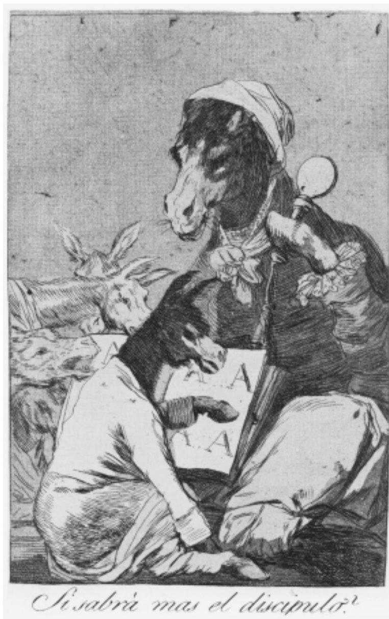
Pompous asses are still teaching lies to credulous fools in universities and elsewhere today. Here, from Francesco Goya's Caprichios: "Might not the pupil know more?"