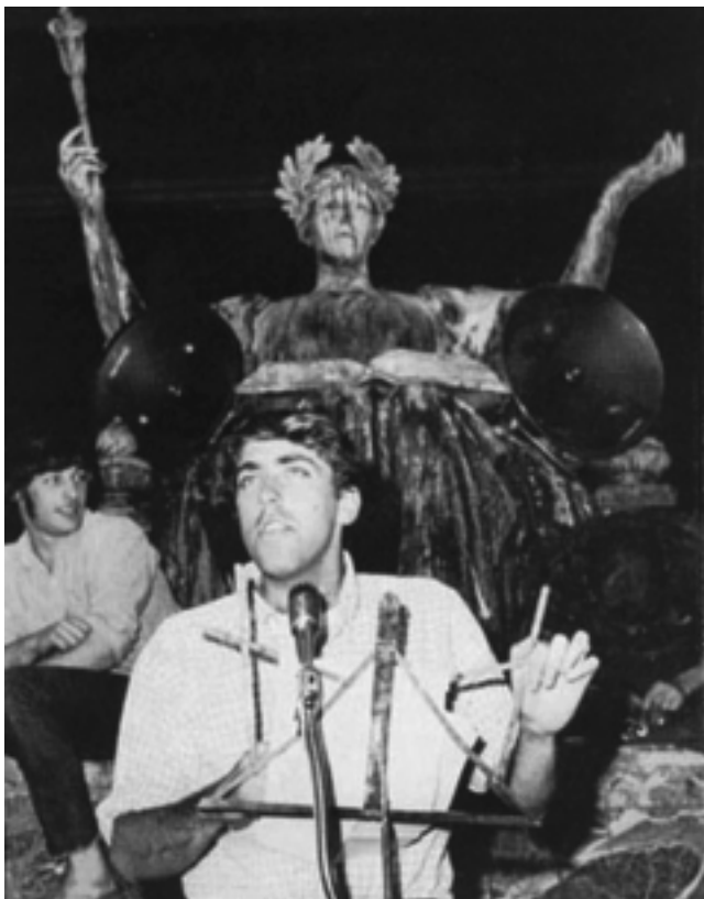
The SDS/Mark Rudd (shown here)-led 1968 Columbia University student strike touched off a wave of "Nietzschean Dionysian violence of which Nazi and similar political movements and revolutions are born."