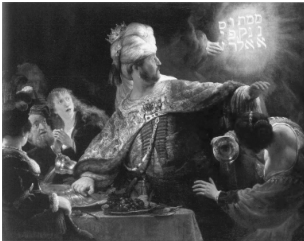
In Rembrandt's painting of "Belshazzar's Feast" (ca. 1635), the King of Babylon commits blasphemy against God, and then realizes in horror his error when he sees the writing on the wall. That very night Belshazzar was slain. Some recognize in Al Gore a similar evil personality.

of man's willful power in, and over the universe, a power which defines man and woman, as Genesis 1 describes this, as set apart from, and above all other living creatures, as man and woman made equally in the likeness, in nature, and character of duties as the servant of the Creator. This is the quality of power, unique to mankind, whose existence is illustrated by the uniqueness of Kepler's discovery of that harmonic principle of universal gravitation which orders the composition of the Solar system as a whole. 5