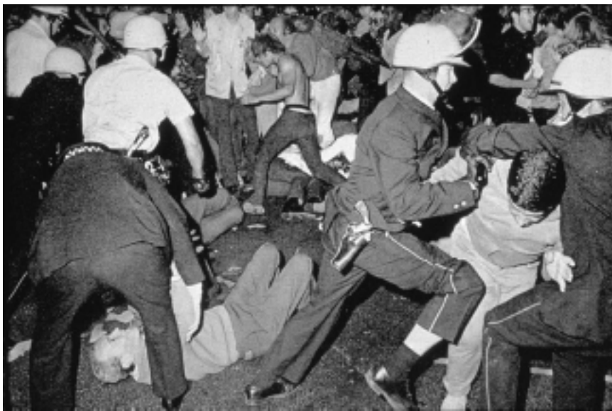
Jacobin anti-war protestors clash with police outside the 1968 Democratic Party convention in Chicago. The 68ers, LaRouche says, divided the Democratic Party, and turned it away from the FDR coalition of workers, farmers, and the poor.

who represent the white-collar culture, of the Baby-Boomer generation, which was built up by brainwashing of children, during the period of 1946 through 1956: Out of that, has come, now, a destruction of the United States and a fascist system.