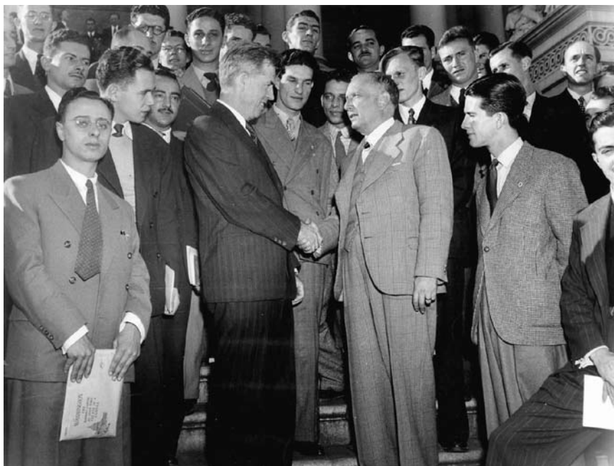
FDR's Agriculture Secretary, and later, Vice President, Henry Wallace, was tasked to work with Haiti, to develop CCC-style camps there. Wallace was also involved in the development of plans to construct the Artibonite Valley Project. Wallace is shown here (center, left), with students and professors at the University of São Paulo, Brazil.

When the Péligre dam construction got underway in 1953, observers referred to the project's location as the "Valley of Hope," because of the enthusiasm it generated among local residents, and its potential for creating jobs, expanding food and other commodity production, controlling floods and soil erosion, and raising living standards through an expanding tax base. New York Times reporter Herbert Matthews wrote, in an article