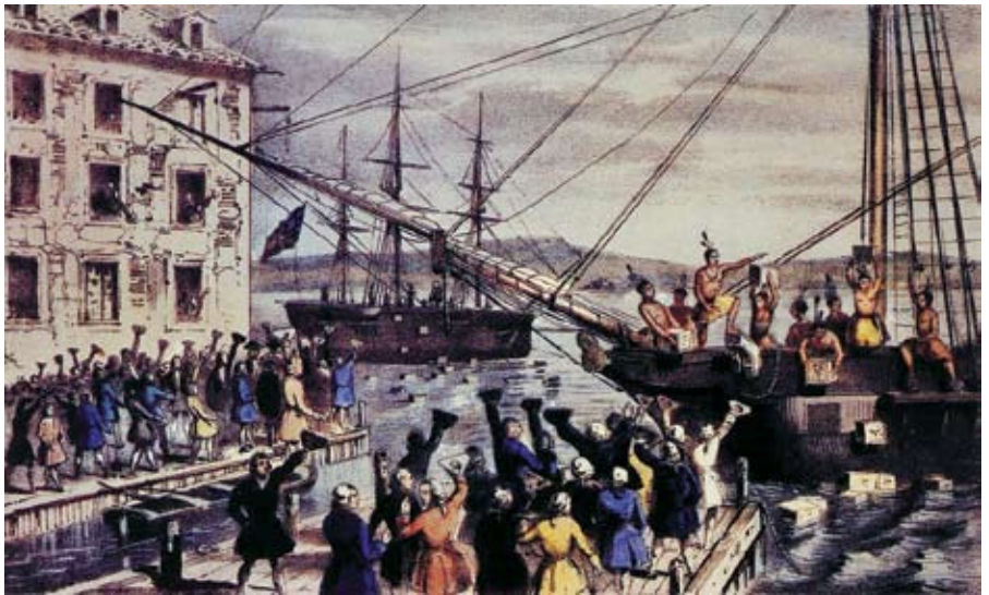
"The Destruction of Tea at Boston Harbor," lithograph by Nathaniel Currier (1846).

Dec. 16 began with a call for the largest town meeting ever seen, and over 7,000 people came to Old South Meeting House, most not being able to squeeze inside. The main speakers were Sam Adams, Dr. Thomas Young, and Josiah Quincy, Jr. All knew the action to be taken next could draw severe punishment, and likely death.