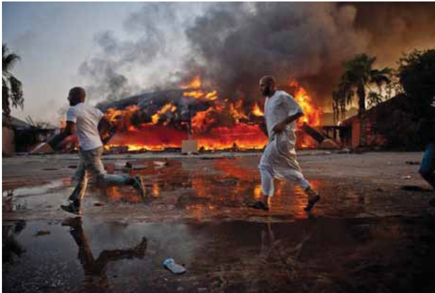
The burning of Colonel Qaddafi's tent in Tripoli, Aug. 24, 2011. Since Qaddafi's murder, the violence has increased.

Up to now, the militias, although not heeding the directives of the TNC, are not trying to overthrow it either. The Council is handling the marketing of oil, which is back up to 1.4 million barrels per day, around the level it was for much of Qaddafi's tenure. (Qaddafi had never gotten above that until the last few years, when it reached 1.7 million bpd. The international oil mafia kept Libya's oil production artificially suppressed during the Qaddafi period.)