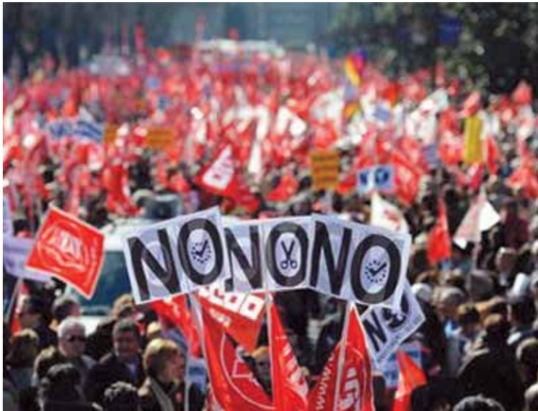
Spain's banks have billions, if not trillions, in non-performing debt sitting on their books, which could implode at any moment. The draconian cuts in spending and living standards have only made things worse. Here, more than a million Spanish workers take to the streets across the country in protest, February 2012.

been cobbled together to help bail out the Eurozone banks. That fund in fact does not exist, but even if it did, it would cover less than 5% of the non-performing assets on the banks' books.