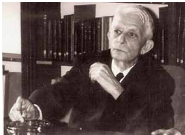
Wolfgang Köhler (1887-1967)