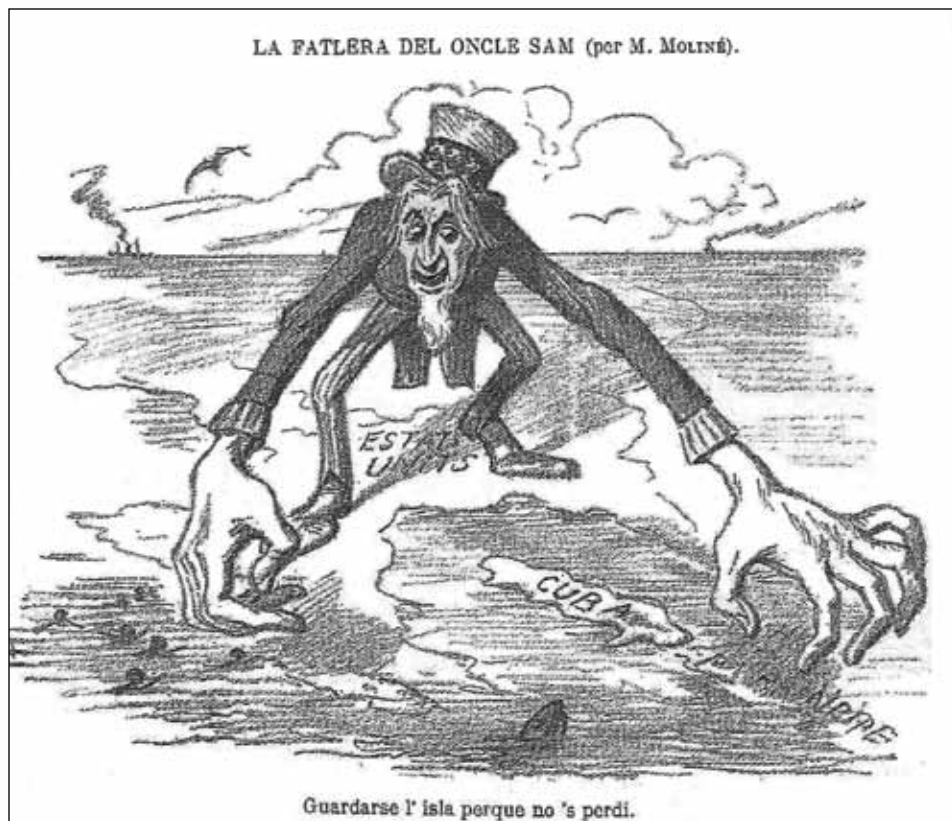
A Catalan newspaper lampoons "Uncle Sam's" folly in the Spanish-American War (1898).