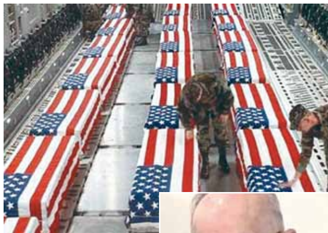
Gen. William Odom, former head of the National Security Agency, said, at the time, that the decision to go to war against Iraq was the greatest strategic blunder in U.S. history. Shown: flag-draped coffins returning from Iraq.

The ascendancy and dominance of the American imperial faction followed the Spanish-American War of 1898, and as I just mentioned, "imperialism," as United States foreign policy, became a national political issue during the national elections of 1900. Those who opposed imperialism were labeled " isolationists " in the press controlled by the imperial faction. "Oh, they're isolationists; they don't want to be imperialists." Non-interventionists might be a better