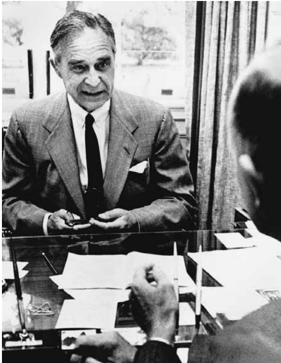
D.C. Public Library