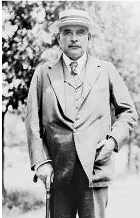
Prescott Bush (left), founder of the Bush political dynasty, got his start as a managing partner in Brown Brother Harriman, whose Union Banking Corp. was seized by the U.S. Government for financing the Nazis. Bush's Wall Street contemporary, J.P. Morgan, Jr., funded Italian Fascist leader Mussolini, and bankrolled an attempted military coup against FDR.

have the greatest recovery that mankind has ever known.”