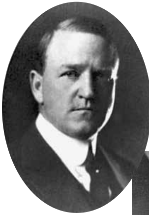
George Herbert Walker (left) and his son-in-law Prescott Bush managed the Union Banking Corp., whose single client was Fritz Thyssen, Hitler's chief fundraiser (shown with the Führer, right); Bank of England governor Montagu Norman (below) was a key member of the "family."