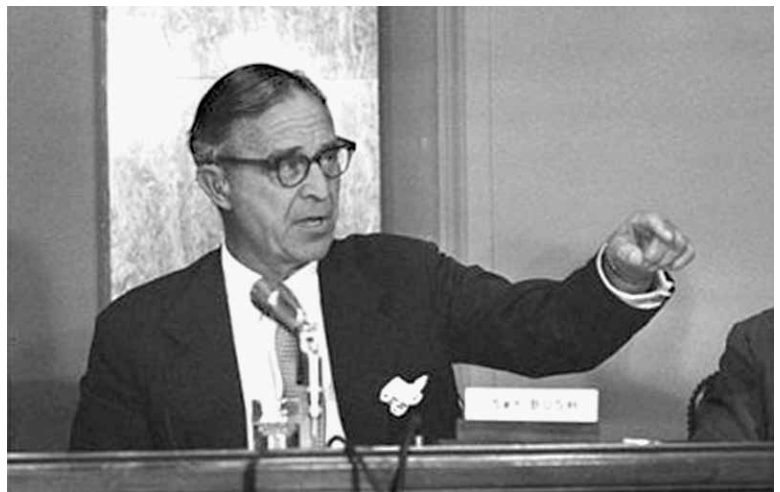
Prescott Bush's leading role in promoting eugenics made him a natural partner for the Nazi master-race strategists.