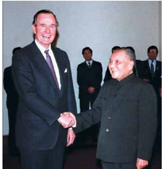
President George Herbert Walker Bush (son of Prescott) carried on the eugenicist policy of his forebears, advising the Chinese leader Deng Xiaoping (right) to sterilize the population.

“[But the] most disturbing aspect of the abortion issue that was brought before the Task Force, is the disparity between the availability of professional abortion services to those women who can afford the $500-$700 to obtain a therapeutic abortion and the estimated one million illegitimate abortions performed by the unlicensed practitioners for those women who cannot