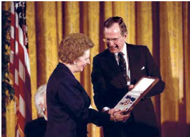
George Bush Presidential Library & Museum

George H.W. Bush was chairman of the Republican National Committee under President Richard Nixon throughout the Watergate scandal, until Nixon’s