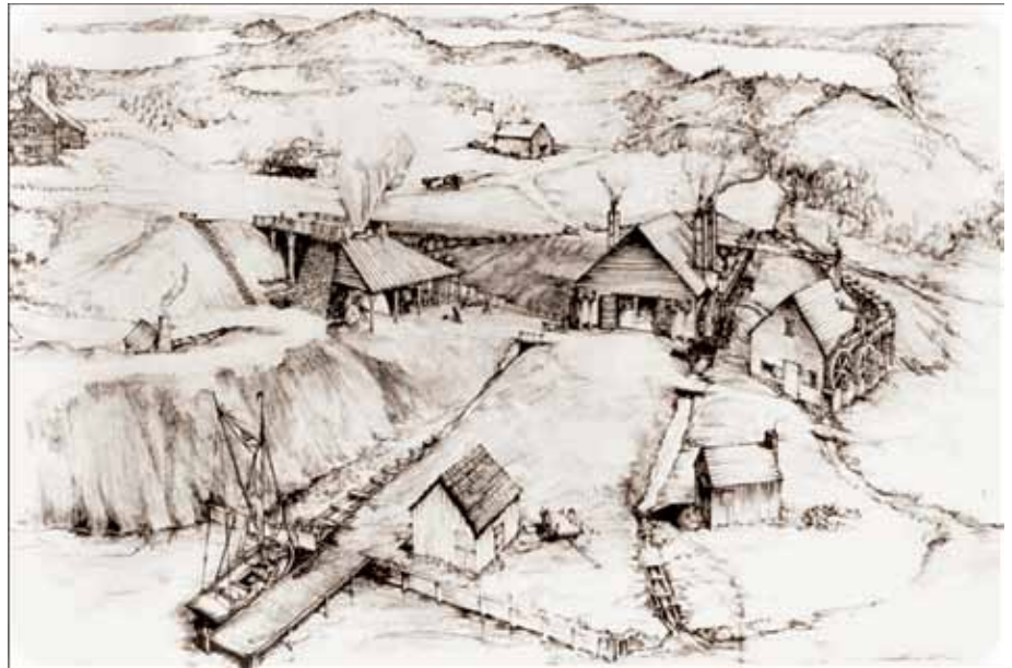
Saugus Iron Works National Historical Site

A similar set of relationships exists for mankind’s true discoveries of principle. From this, we can adduce a general principle of physical energy-flux density . Truth becomes clear, when we take into account the Classical poetry and related means of an actually Classical type of truly humanistic energy-flux density, such as the example of Filippo Brunelleschi’s artistic composition of physical principles, and that like in the unique notion of design of the principles of “hanging ropes” (and the like) for the dome of Santa Maria del Fiore of Florence and the musically (physi-