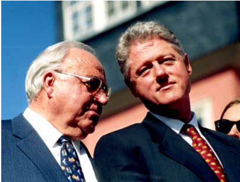
President Bill Clinton was destroyed by a British intelligence operation, to prevent him from carrying out LaRouche's approach to dealing with Russia and the world financial disaster. Clinton's good relationship with German Chancellor Helmut Kohl (shown here) would have been an asset in pursuing that collaborative approach.

vices, using a Republican leadership as its accomplice in this crime against the U.S. Presidency itself, rather than merely the subject of President Clinton as such.