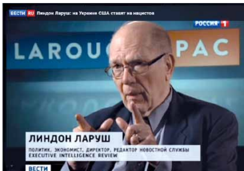
Lyndon H. LaRouche, Jr., on the Vesti Russian TV program, March 6, 2013.

Anchorwoman: It is obvious that the coup in Kiev could not have happened without direct support from the West. Prominent EU and U.S. politicians openly visited the Maidan and supported the mob's intention to overthrow the demo-