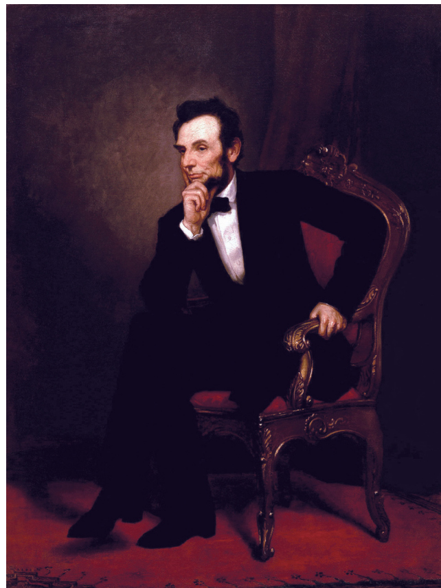
Without President Abraham Lincoln’s “greenback” policy, an echo of Hamilton’s genius, the British would have succeeded in destroying the United States, “as if with a virtual single blow.” Painting of Lincoln by George Peter Alexander Healy (1869).

He had designed what would be, in his intention, later, a precise echo of Hamilton’s scientific genius: a precise echo, today, of what had been President Abraham Lincoln’s strategically crucial “greenback” policy. Without that Lincoln “Greenback” policy (from which a truly wise United States would have otherwise never returned), what the British had intended, would have succeeded in destroying the United States, that as if with a virtual single blow. Without the pure genius of the greenback policy: a policy which had been in accord with the systemic genius expressed as by President John Quincy Adams, and President Franklin Roosevelt’s Glass-Steagall reform. The United States is