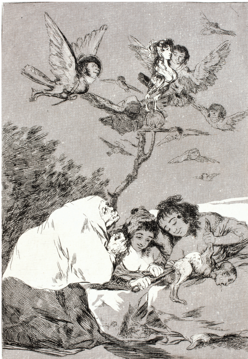
Francisco Goya, "All Will Fall," from "Los Caprichos" (1797-99).

This Obama situation smells as if Adolf Hitler's ghost were occupying the body (in the absence of a true mind) of our current U.S. (virtually British) puppet-President Obama. Meanwhile, our own frightened political cowards and opportunists, adapt themselves to both their waning hope for personal greed, but also with an increase in their fears of the monster who is the current U. S. President. The price of giving in to their frankly understandable, but still unforgivable fears, now threatens the probable extinction of the human population of this planet. We are, thus, obliged to fight for the regaining of the freedom which had been taken from us by the junior Bush (i.e., Cheney) and Obama Administrations.