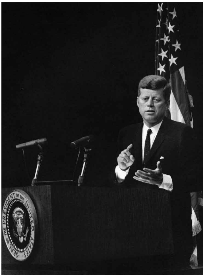
John F. Kennedy Presidential Library and Museum, Boston