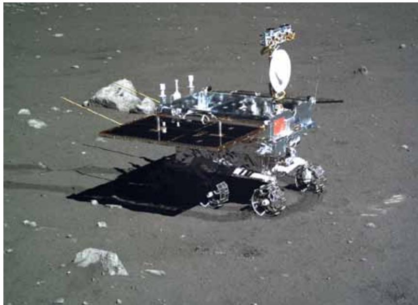
China, in contrast to the U.S., is progressing: It has growth rates of 7-8%, a highly advanced fusion program, and successfully landed its Jade Rabbit rover on the Moon, with plans to mine helium-3 for future fusion production on Earth.

And there was a big discussion that the whole crisis was originated by the mistake of the West! Because the