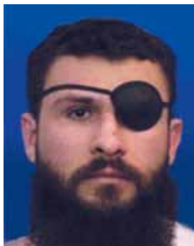
U.S. Department of Defense

While Turki, as head of Saudi Intelligence and Osama bin Laden's handler, is suspected of playing a commanding