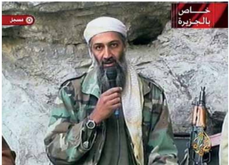
Osama bin Laden was recruited by Prince Turki to become a jihadi and to use his substantial financial resources to set up the Maktab al-Khidamat network, which became al-Qaeda.

“In 1979 Usama Bin Ladin went to Prince Turki for advice after he became infuriated by the Soviet invasion of Afghanistan. Following Prince Turki’s sugges-