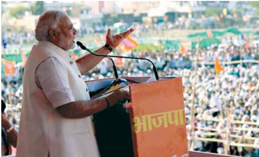
Narendra Modi's Photostream

Narendra Modi campaigning in Maharashtra state, March 24, 2014. He promised to build roads, airports, ports, bullet trains, and 100 modern cities, and the nation's youthful electorate responded.