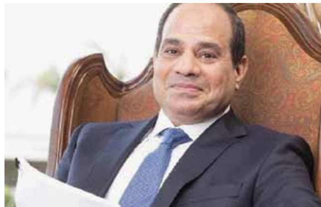
Al-Sisi official campaign

The Toshka agricultural project is located in Egypt's Western Desert, which is the easternmost extremity of the Sahara Desert. The project will transfer water from Lake Nasser, which is formed by the High Aswan Dam on the Nile, in cooperation with all the nations along the Blue and White Nile, all the way down to the beautiful