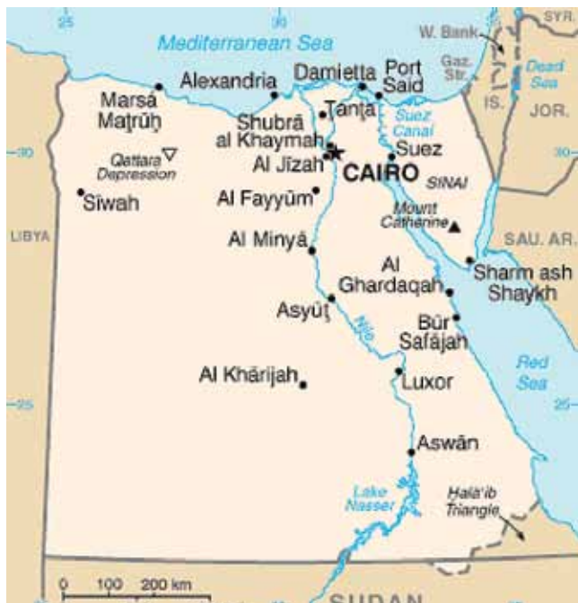
FIGURE 1 Egypt

The development of the war-ravaged Darfur province in Sudan, as well as South Sudan, will become an integral part of these projects.