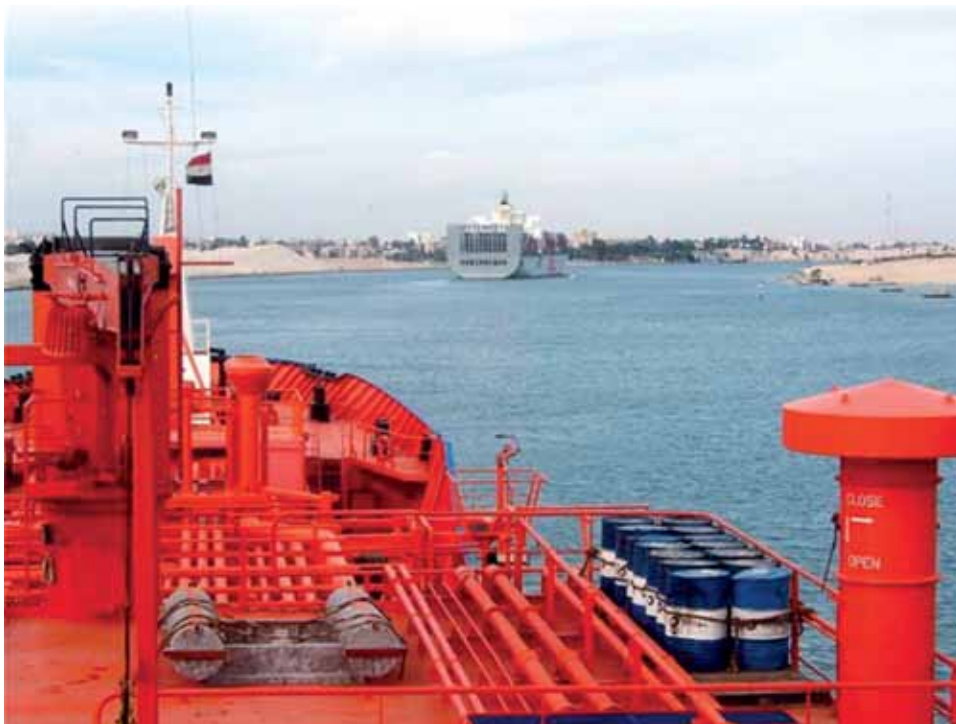
Suez Canal Authority, suezcanal.gov.eg