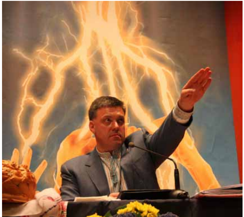
Svoboda Party leader Oleh Tyahnybok, known for his 2004 speech denouncing the "Moscow-Jewish mafia that rules Ukraine."

During Yanukovych's years in office, night-time torch marches, demolition of [Soviet-era] monuments, insults to veterans of the Great Patriotic War, 1 and media promotion of collaborationists from the Organization of Ukrainian Nationalists and Ukrainian Insurgent Army (OUN-UPA) such as [Stepan] Bandera, [Roman] Shukhevych, [Yevhen] Konovalets, and others, became standard features of Ukrainian political life. Government agencies did nothing to hinder the dissemination and popularization of the misan-