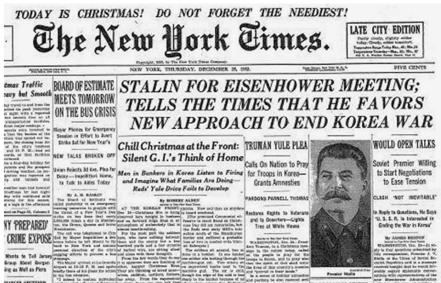
The New York Times' Christmas Day 1952 interview with Josef Stalin, in which Stalin welcomes the idea of a meeting with Eisenhower. The British were apoplectic.

Nonetheless the Korean Armistice was signed on July 27, 1953. The Austrian peace treaty and subsequent removal of all foreign troops and its neutralization did not occur until May 15, 1955.