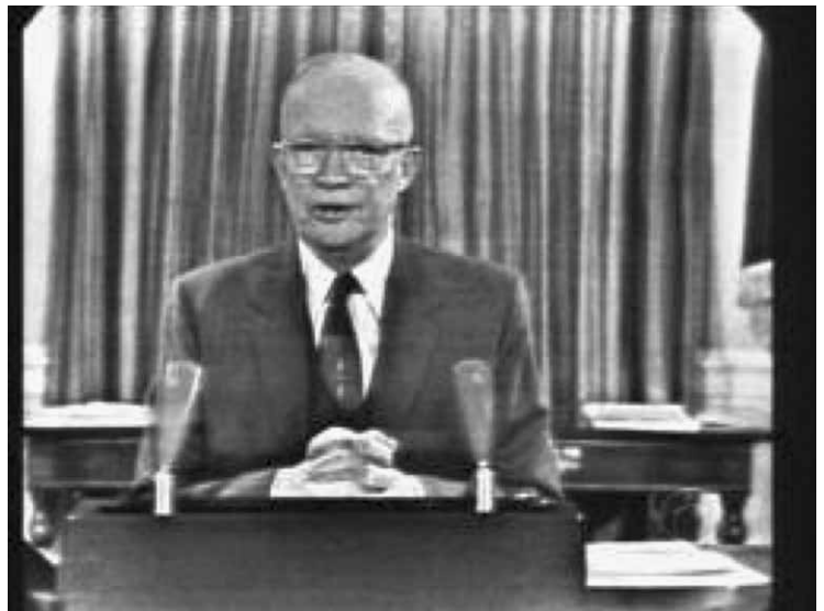
President Eisenhower delivered a shock with his farewell address on January 17, 1961.

The prospect of domination of the nation's scholars by Federal employment, project allocations, and the power of money is ever present and is gravely to be regarded. Yet, in holding scientific research and discovery in respect, as we should, we must also be alert to the equal and