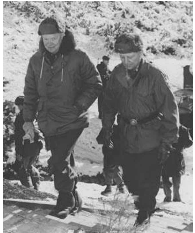
President-elect Dwight D. Eisenhower (left) during his visit to Korea in December 1952.

Eisenhower had a secret, or not-so-secret, weapon not only to end Korean War, but to reestablish trust between the United States and the Soviet Union. That secret weapon was his old commander and war time collaborator, General Douglas MacArthur, for whom Eisenhower served as chief deputy for almost ten years