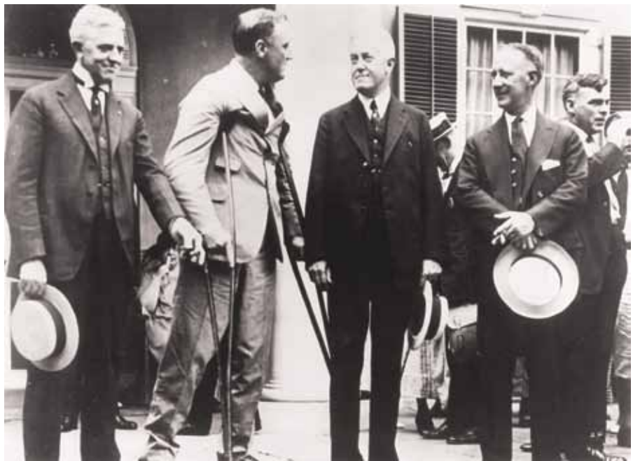
FDR Presidential Library & Museum

His Labor Secretary, Frances Perkins, was one of the few people who worked with him through the Gov-