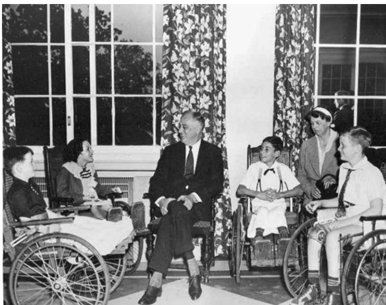
FDR talks with fellow polio patients in Warm Springs, Georgia, the rehabilitation facility which he funded, and was open to any polio victim in the country.