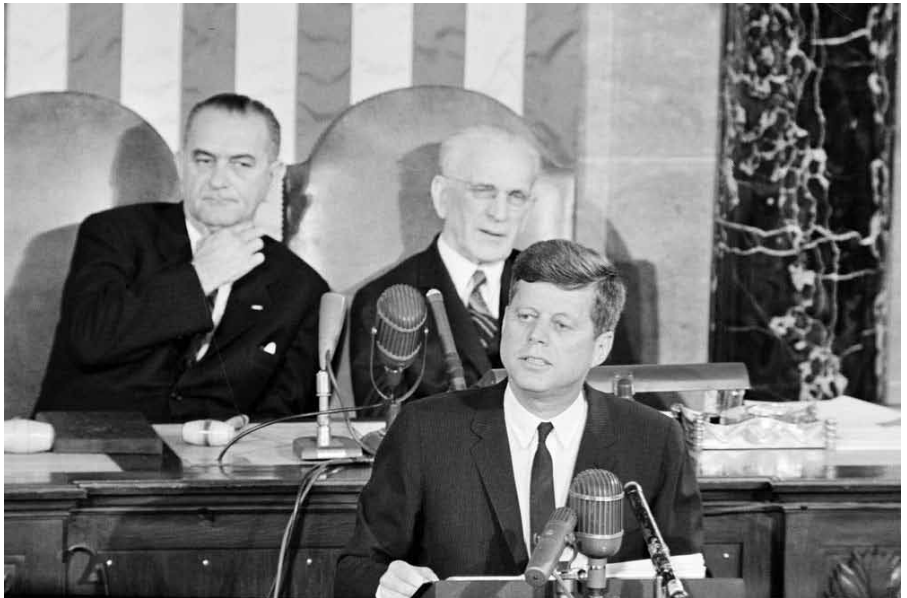
President John F. Kennedy viewed it as one of his great responsibilities to reduce Cold War tensions in an atmosphere of great fear over a possible nuclear war. Here he delivers his State of the Union address to Congress, Jan. 11, 1962.

So I went over, and then, he’s walking up and down, so I walk up and I put my arm around him, and we walked up and down for a while. And, what the hell