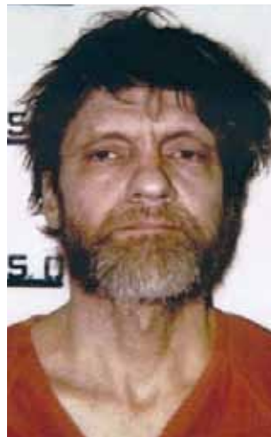
Federal Bureau of Investigation