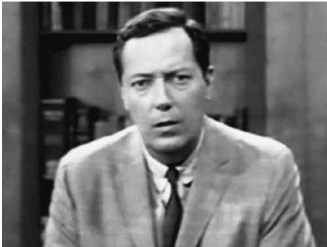
New Orleans District Attorney Jim Garrison. Hale Boggs, who had been on the Warren Commission, became convinced that the destruction of Garrison was based on the fact that Garrison was right, there was a conspiracy to assassinate President Kennedy.

those guys who blew that up at that time. The FBI gave them a million bucks! One million dollars, and showed them how to make bombs, and rent the farm here in New Jersey, rent a Ryder trucker. The colonel disappears and they blow up the basement of the World Trade Center in, when was that? In '93 or something; whenever it was, before the main one.