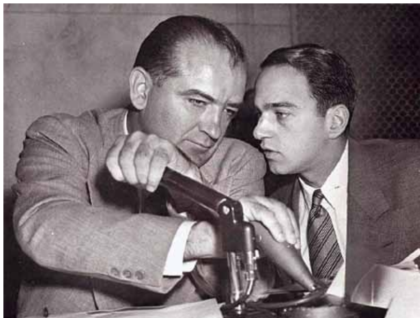
J. Edgar Hoover's agent, Roy Cohn (right), seen here in his role as aide to Sen. Joe McCarthy (left), 1954.