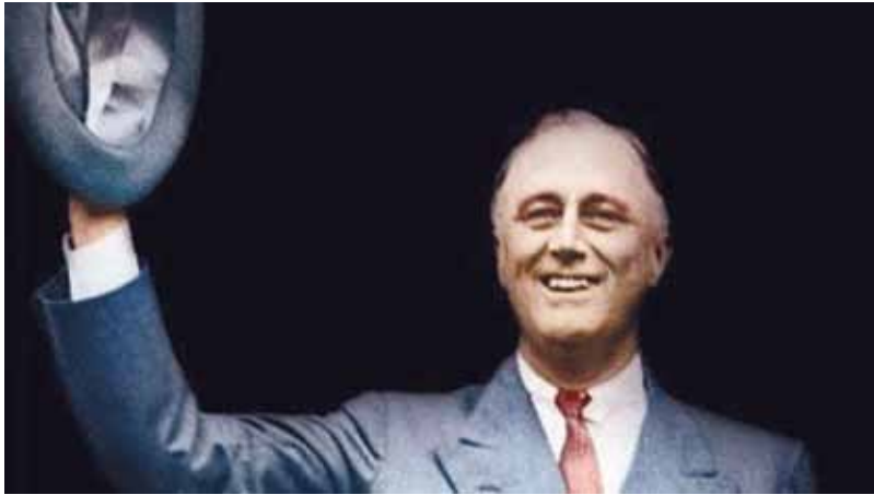
Kennedy was returning to the legacy of President Franklin D. Roosevelt, "there's no question about that."

think the policies of [Secretary of State John Foster] Dulles and the standoffishness of President Eisenhower, who had the admiration of the world for his role in the war—but policy was really driven by Dulles, though revisionist history says that the man behind it all was Eisenhower, which is probably true. I think he was probably more of a manager than one who was making policy. I think that Dulles added to the policies of Truman and [his Secretary of State Dean] Acheson and left no room for diminution of the Cold War. I think Kennedy viewed that as one of his great responsibilities, to reduce those tensions.