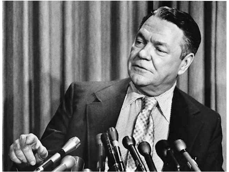
In April 1971 Hale Boggs—then House Majority Leader—called for Hoover's resignation from the floor of Congress. He sought to re-open the investigations of the assassinations of JFK, RFK, and MLK. In October 1972, the plane in which Boggs was traveling disappeared in Alaska.