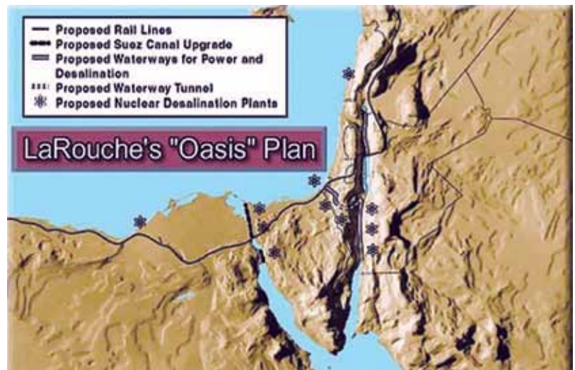
One of the LaRouche Oasis Plan maps for Middle East development in the plan's 1995 version. LaRouche had included the plan in his 1975 publication, How the International Development Bank Will Work.

LaRouche insisted on giving nuclear power to the the Palestinians and Israelis for desalination, and several designs for safe, modular nuclear power plants had already been provided by companies including Germany's Siemens. Other companies, such as California's General Atomics, had provided designs for desalina-