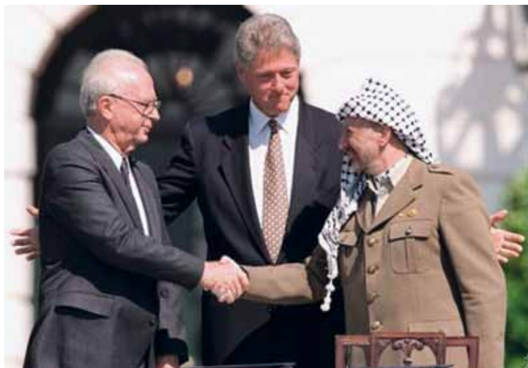
Israeli Defense Forces

On Sept. 13, 1993, after more than 45 years, the active war between the Palestinians and the Israelis fell quiet when Israeli Prime Minister Yitzhak Rabin and