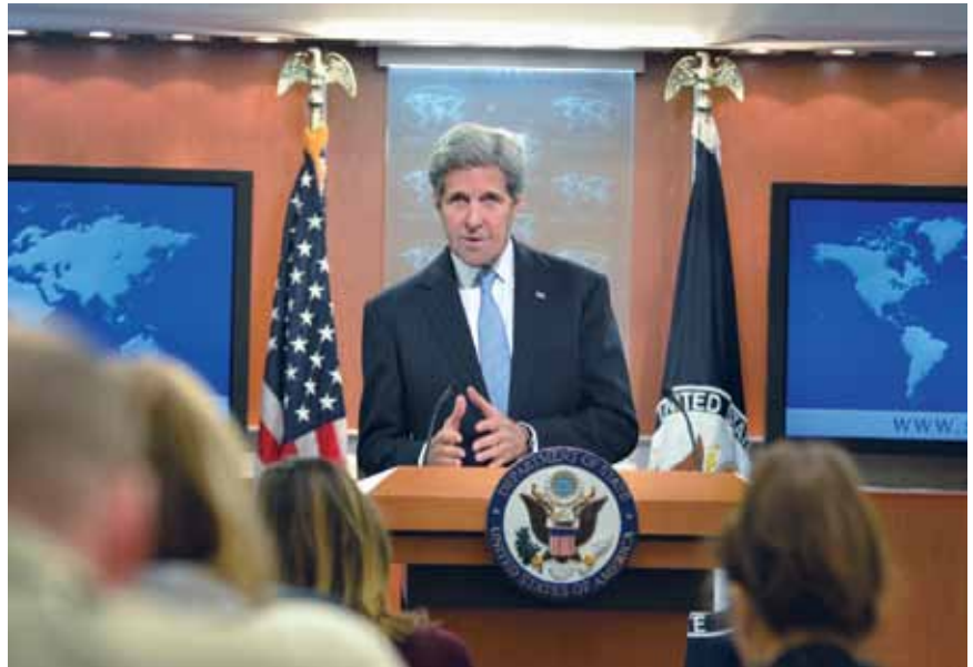
Department of State

In the beginning of the event, Russian President Putin was streamed live into the amphitheater there, and delivered a prayer in which he situated the significance of this concert. He began by saying, “This concert should be a sign of our gratitude, remembrance, and hope.” He