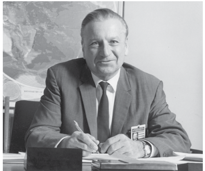
Krafft Ehricke envisioned the tasks for the exploration of our planetary system.

Yet, however impressive these projects are, this method of linear listing of projects remains insufficient to grasp the metric of growth now developing in Eurasia. They are too easily dismissed as simply infrastructure projects, though the scope of area (nearly 50% of