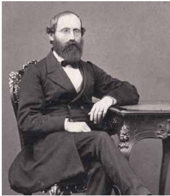
The German scientist and genius, Bernhard Riemann.

Human culture cannot remain dominated by either a monetary metric, or by physical consumption levels. Mankind's total emergence from the physical restraints of poverty (fresh water, electricity, basic infrastructure, etc.) requires a new notion of value, beyond discrete statistical measurements. As German scientist Bernhard Riemann understood, the only metric of value sufficient within a system of non-linear transformations is one which is continuous, i.e. a metric