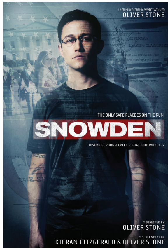
A poster for the movie Snowden, directed by Oliver Stone.

Snowden's background, as shown in the film, was as a deeply patriotic individual who wished to serve his country. He personally revolted against what he recognized as a criminal use of these programs during the Bush/Cheney years, but he stuck with the system when Obama, in his campaign speeches in 2008, pledged to end it. Only when it was clear that Obama had lied and was going even further than Bush, did Snowden decide he had to act on his own.