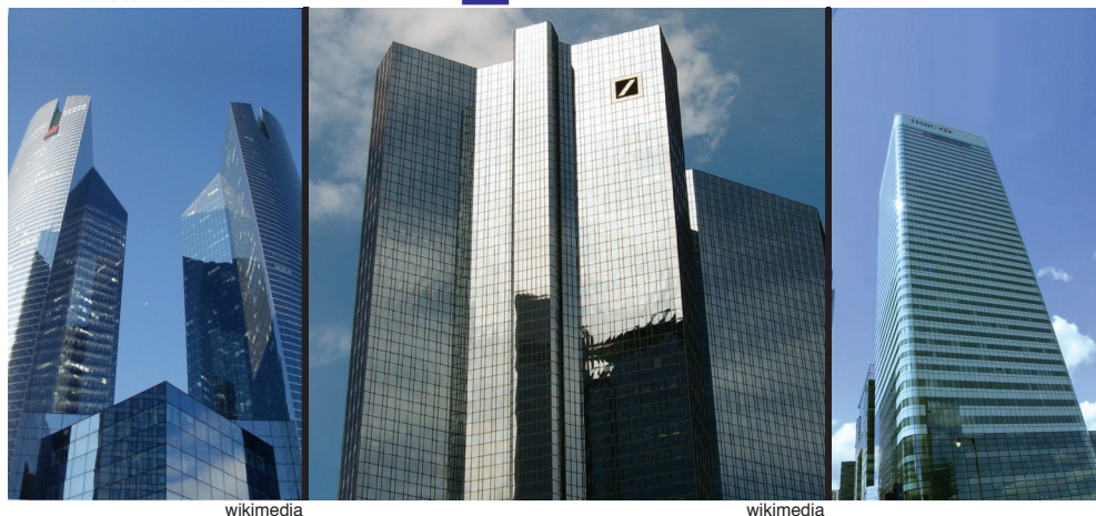
The headquarters of some European Banks towering far too high for the level of their risky assets.

in the harshest terms, and announced an escalation of their campaign for justice.