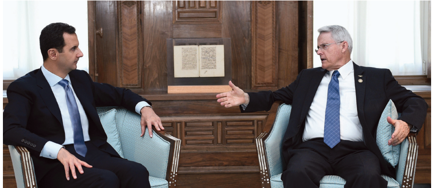
President Bashar al Assad (left) meets Virginia State Sen. Richard Black in Damascus, April 28, 2016.

Furthermore, my travels beyond Palmyra in April left no doubt that the U.S.-led Coalition deliberately allowed ISIS to cross 100 miles of open desert without dropping a single bomb. They could easily have interdicted the hundreds of tanks and other vehicles that