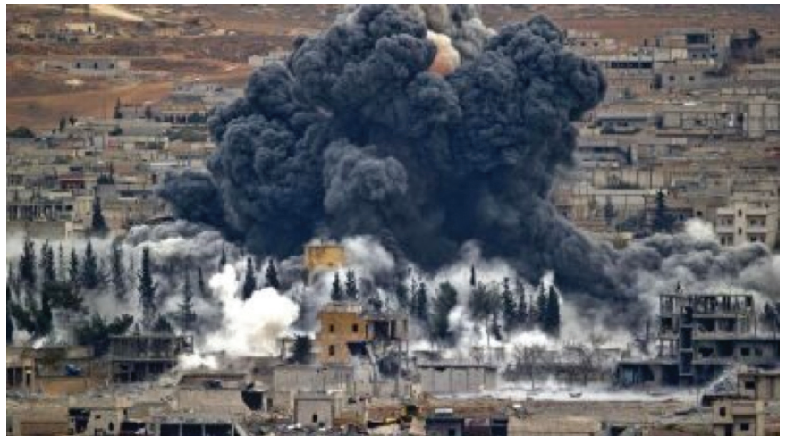
Deir al-Zour, where a U.S.-led strike killed up to 80 Syrian government soldiers.