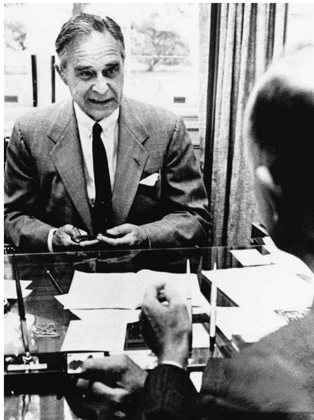
Prescott Bush

Post-Revolutionary America, however, has had few great Presidents. Washington, John Quincy Adams, Lincoln, and FDR were the standouts. Hamilton was also a President “without portfolio.” Others, such as the patriot Ulysses Grant, William McKinley, or John Kennedy, were fully justified in their proud opposition to Britain, although they were defeated in the execution of their intentions. When FDR died, the United States