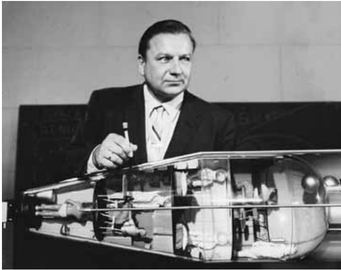
Krafft Ehricke demonstrates the plan for the interior of a space station.