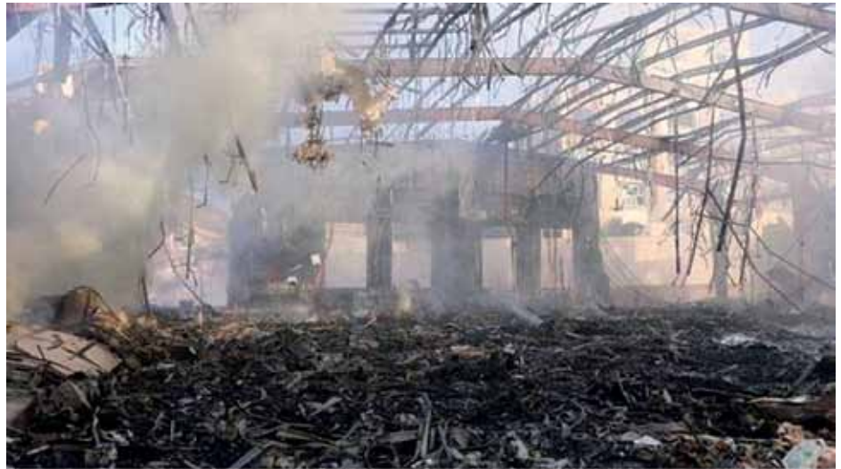
The funeral hall in Sanaa was destroyed.

Since then, the Saudis have admitted that "the on the ground intelligence was inaccurate." The Saudis regularly kill people indiscriminately in market-places, in funeral processions, and in wedding parties—in fact, in