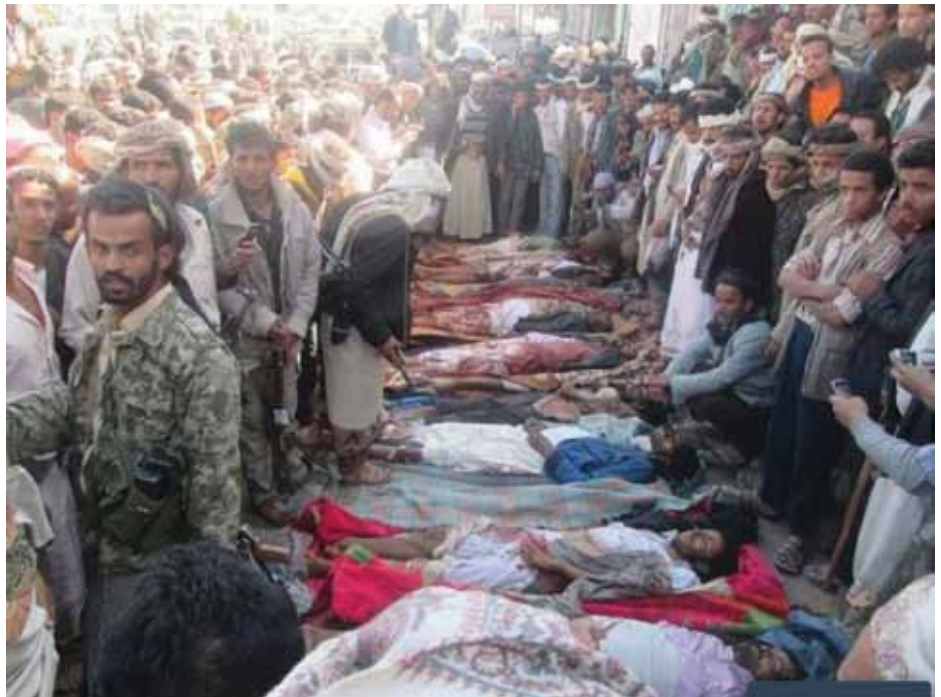
U.S. drone killed 17 innocent civilians in Ra'ada, Yemen in 2013.

The fact of that lawless killing being done under the pretext of “defense of the homeland,” despite its being unacknowledged, has also had a great destructive effect on the psychology of U.S. domestic law enforcement, many of whom are former military personnel. Take for example the problem of the shootings and violence, as well as police violence, in American cities. To what degree has the resonance of eight years of drone killings, mass executions, murderous deposi-