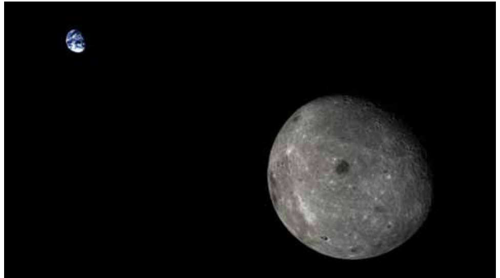
State Administration for Science, Technology and Industry for National Defence, China

Lunar industry should be viewed as an organism that, over time, evolves to progressively more