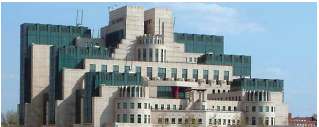
The MI6 Building in London, 1994

Of course, this, to a certain extent, started with the release by MI-6 operative Christopher Steele of the 35-page notorious document full of absolutely crazy, made-up stories about how Donald Trump was being blackmailed by the Russians because they caught him cavorting with prostitutes, urinating on prostitutes, God knows what else. This Christopher Steele, an MI-6 operative, had been hired by the Democratic Party, the