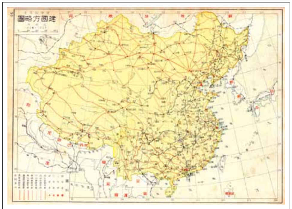
Sun Yat-sen's map for the development of rail and canals for China, 1919. A comparison with China's current extensive rail development shows that Sun's program has finally been realized.

So during that May 4th Movement which Sun was intervening in, to build into a republican movement, he polemicized against what he saw as the influence of a British irrationalism. He said: "A group intoxicated with a new culture have begun to reject the old morality, saying that the former makes the latter unnecessary. . . . [They say] there are no princes in a de-