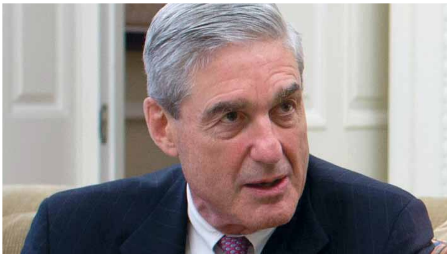
Special Counsel Robert Mueller.

has to be said to the American people with respect to the promised transformation in the American physical economic circumstance. Whether you talk about that as being a new form of infrastructure or a new economic platform, however you put it, that is not going to come into being unless our organization, the Manhattan Project, is successful in galvanizing, as we've done before, the nation as a whole, to do that.