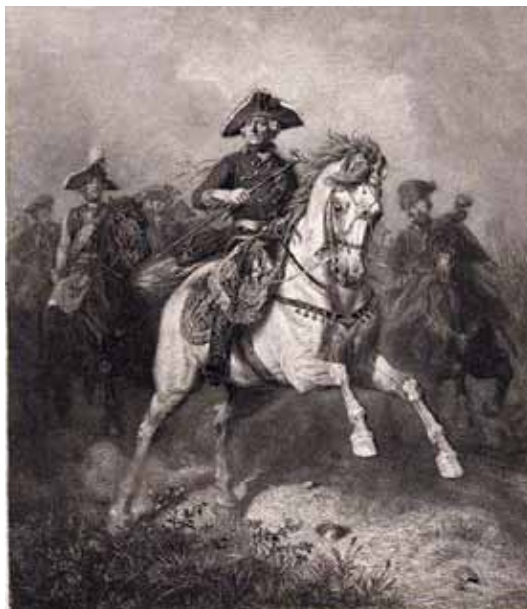
Frederick the Great

It's been said that Robert Mueller is very linear in his thinking. I would suggest that Robert Mueller's office is probably about 36 lawyers deep who are hostile to President Trump, favorable to Hillary Clinton, and work with the British. That's very definitely to our advantage in this situation. Lyndon LaRouche continues in this piece: "Prussian troops under Frederick the Great's command did what the Austrians had assumed to be an impossible deployment—scampering." But I highly recommend scampering when it serves a strategic purpose. "Surprise lies in the mind of him who either does not know or is self-blinded by his refusal to know, like the routed Roman commanders at Cannae."