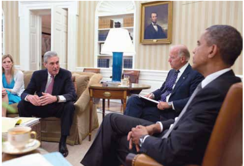
President Barack Obama and Vice President Joe Biden meet with senior advisors in the Oval Office, July 20, 2012. From left, are: Kathryn Ruemmler, Counsel to the President, and FBI Director Robert Mueller.

After Christopher Steele wrote his first memos in June 2016, he flew to Rome to brief his FBI contact in the Eurasian Serious Crime Division of the FBI, which is the unit that Andrew McCabe was previously associated with in New York City. Then, it's reported by the Guardian that in the summer of 2016, Robert Hannigan, the head of GCHQ, flew to the United States to meet with Brennan to argue that Trump's associates are